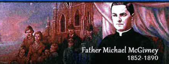
Father Michael McGivney 1852-1890