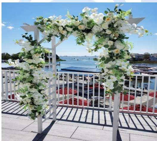
Arbor w/ flowers- $150