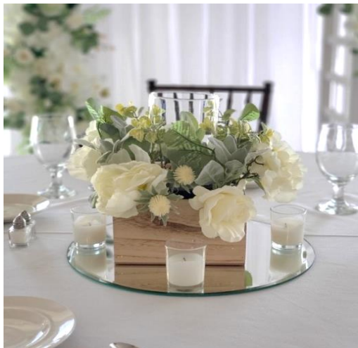
Floral Arrangement- $30 each