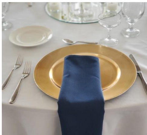
Gold charger- $2 each