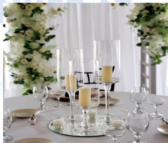
Set of 3 candle holders- $35 each