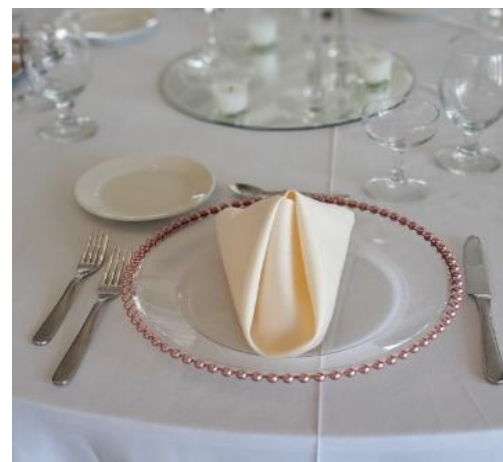
Pearl Charger- $3 each