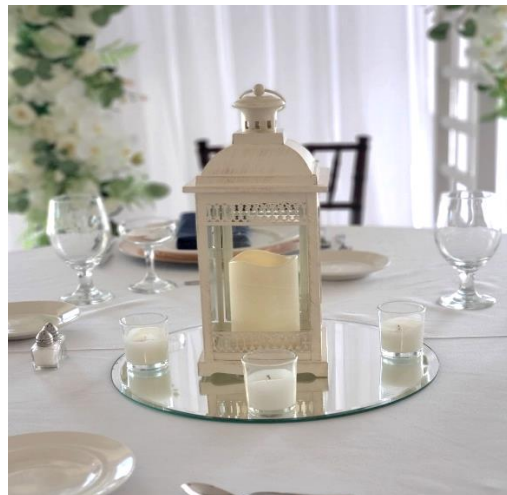
Lantern- $30 each