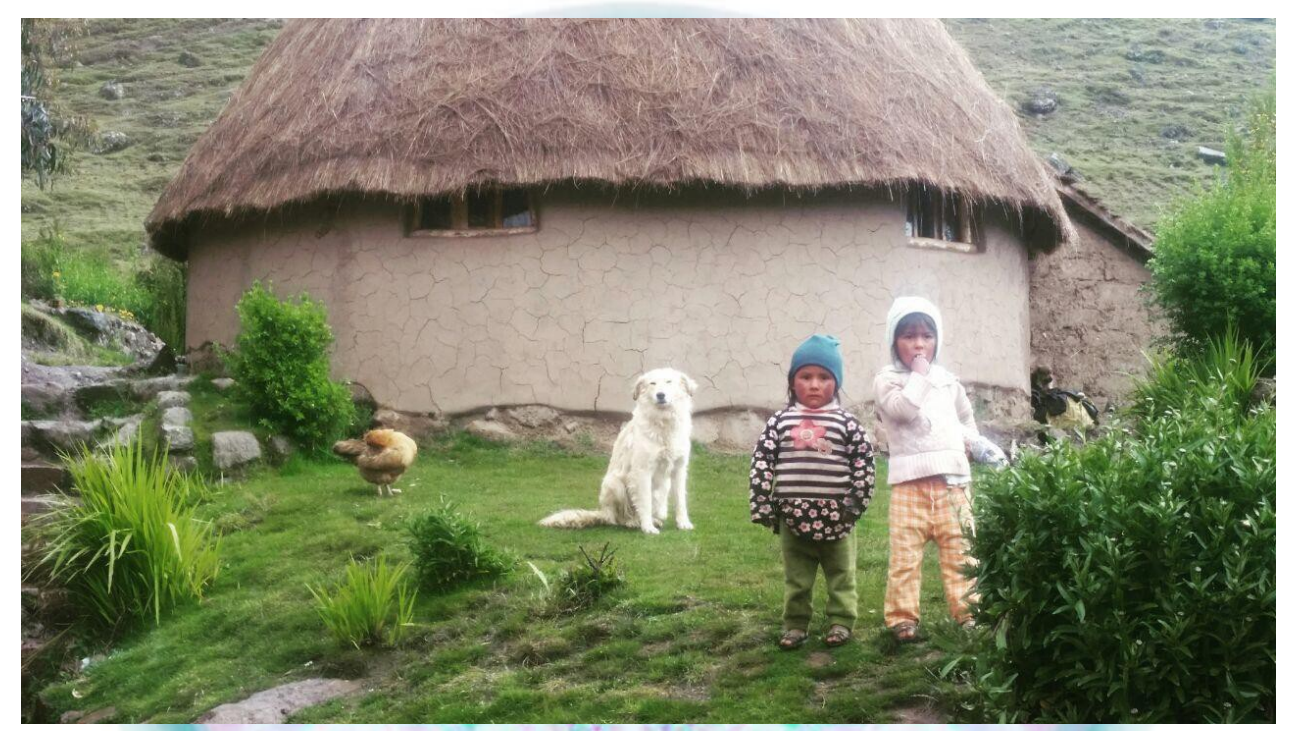
Much Love, Gratitude & Respect. Thank you!