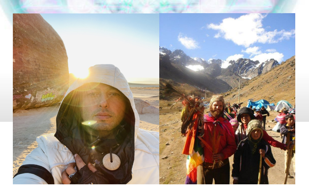
<u>StargateTours.org</u> - <u>Skywalkerhealings.com</u> - <u>Facebook.com/TheSungate</u> -

Registration & Payment: <u>Ahmed.feqy@gmail.com</u>