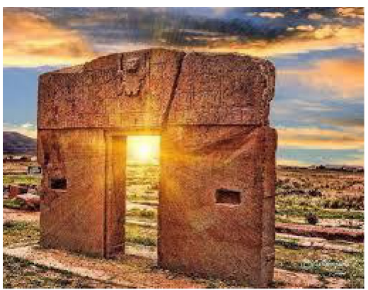
Day 11: Return to Cusco

We will be making our way back from the island to Puno and then to Cusco by bus to catch our return flights home.