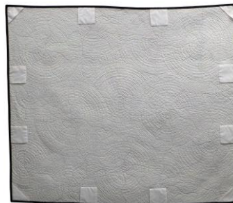
View of back of artwork