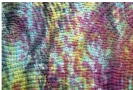
Detail image of artwork

Installation of this piece can be in either a vertical or horizontal orientation, which increases the display options for this work. Merging this artwork with any or all the pieces in this series, creates a dynamic contemporary artwork with unlimited shape and size installation possibilities.