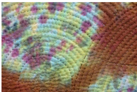
Detail image of artwork

Installation of this piece can be in either a vertical or horizontal orientation, which increases the display options for this work. Merging this artwork with any or all the pieces in this series, creates a dynamic contemporary artwork with unlimited shape and size installation possibilities.