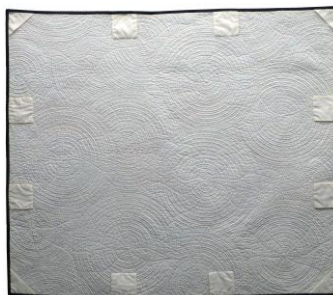
View of back of artwork