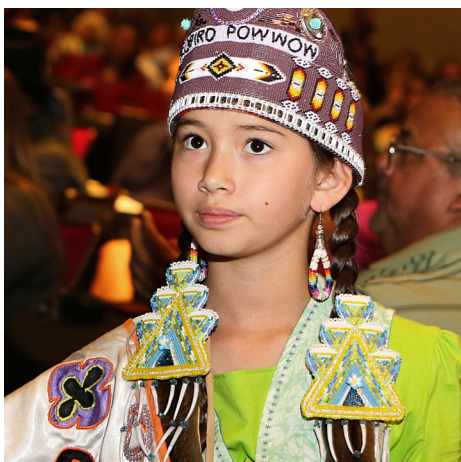
Soaring Eagle Dancer