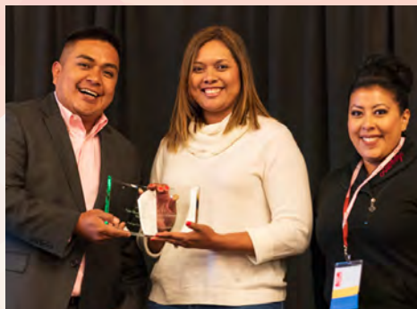
Member Program of the Year 2018, New Mexico Indian Child Welfare Consortium

"I felt the atmosphere at this conference was very comforting. I felt like there was much healing that took place and very important information gained."