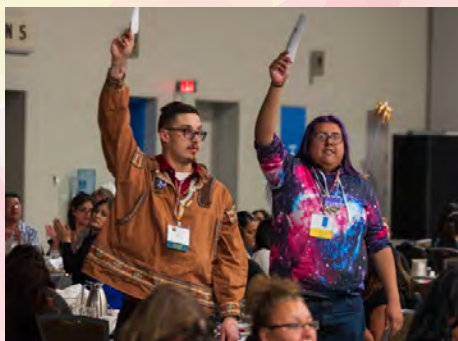
Attendees pledge to support NICWA's mission with donations during banquet dinner paddle raise