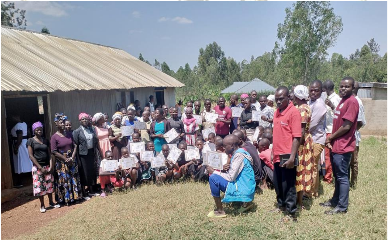
Homabay Youth with their certificates.

On August 6, the students successfully completed their study program, having gained a deep understanding of spiritual truths and the glory of God. To honor their dedication and commitment, each participant who finished the program received a certificate of completion. This recognition not only celebrated their hard work but also marked an important milestone in their spiritual journey, symbolizing the knowledge and growth they achieved throughout their studies.