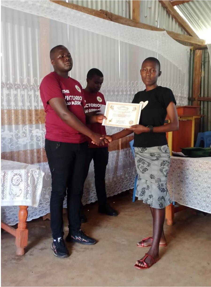
Awarding Certificates in Homabay