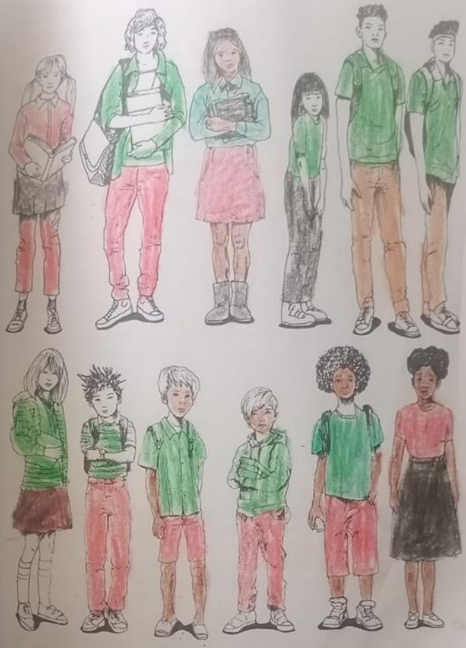
Coloring of the VW book.

ing the kingdom of God and his righteousness. gement. Celebrate them when they make good coming alongside your young warriors as they ire, Jesus-focused adults.