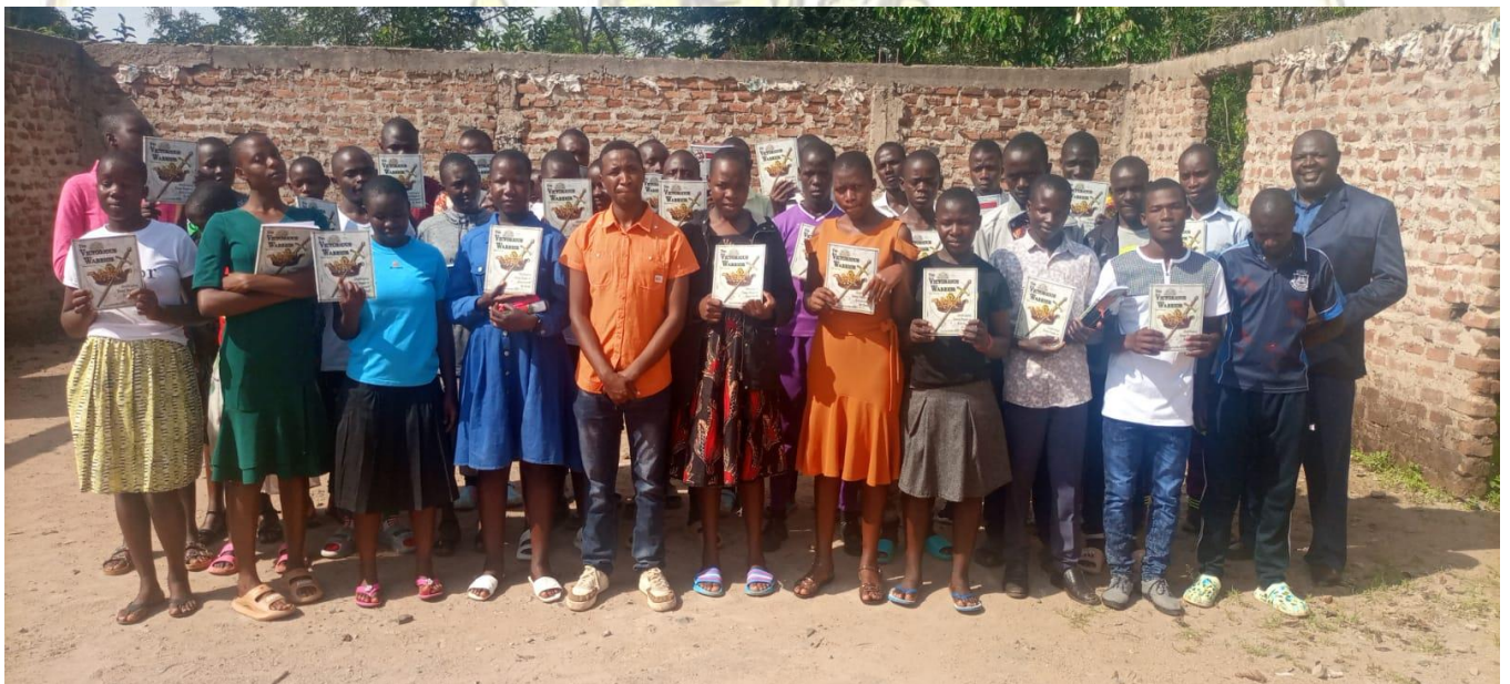
Youths from Homabay

On February 18, we established a group in Homabay for around 60 students, all of whom are orphans. Our mission was to support their spiritual growth and encourage them to pursue a positive path in life. We organized activities and discussions to help them strengthen their faith, find inner resilience, and build a sense of community. Through these efforts, we aimed to empower them to face life's challenges with hope and confidence, fostering their journey towards a brighter future.