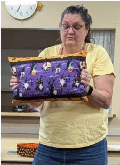
Pam Avara—Halloween Sofa Pillow, Applique Tea Towel, Table Topper, Table Runner, Wicked Big Hexi Table Topper, Riely Blake Panel Quilt