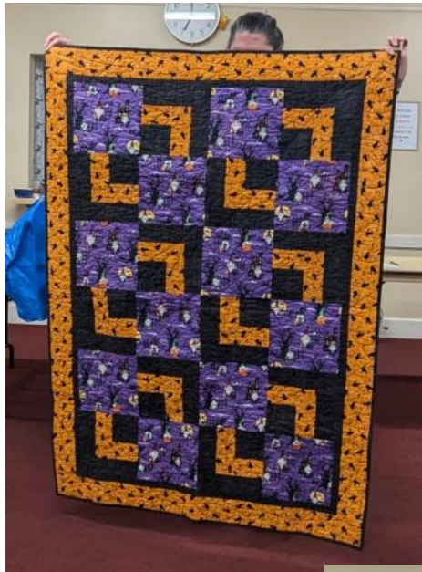
Pam Avara—Halloween 3 yard Quilt