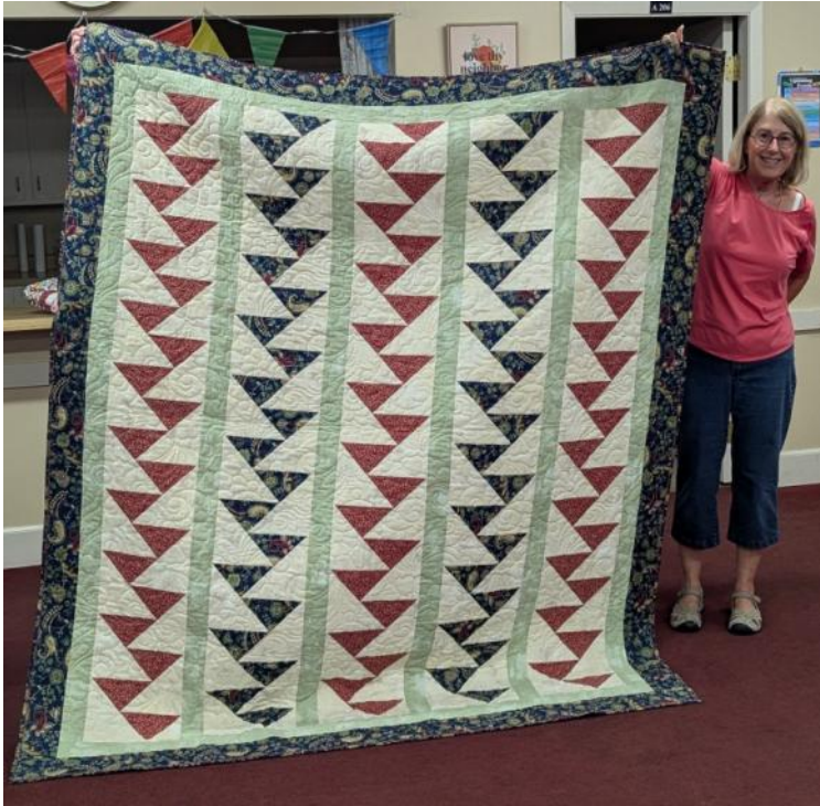
Shelly Taylor—Migrating Geese