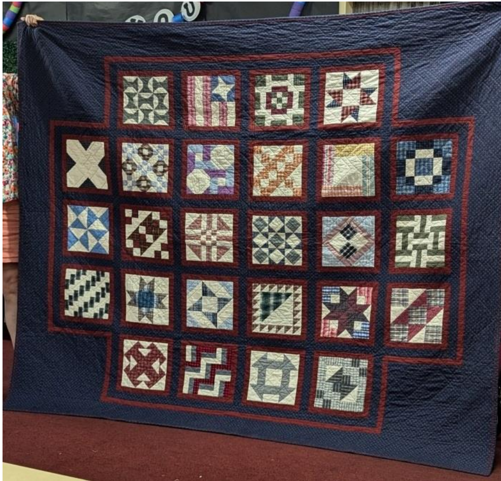
Pamela Avara Alphabet BOM (top) QBHD Pizza Box (bottom left) Brandon Quilters BOM (bottom right)