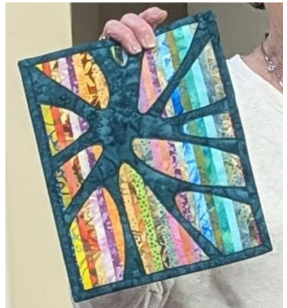
Strip project for next month.