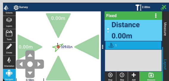
Sub-meter guides provide fast, precise staking