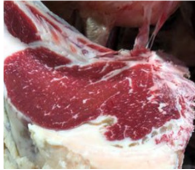
'A' Carcass Examples