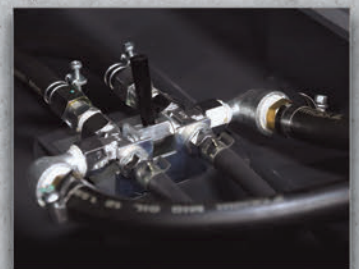
9 | External Fuel Tank Connections with 3-Way Selection Valve

BEST-IN-CLASS dBA RATING // 24-HOUR RUNTIME // WIDEST VOLTAGE RANGE THE INDUSTRY'S HIGHEST-QUALITY MOBILE GENERATORS