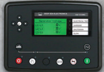
1 | DSEgenset® Digital Control Panel Model 7310 MKII