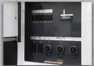
2 | Single-Phase Receptacles 120V - 20A x 2 | 240V - 50A x 3