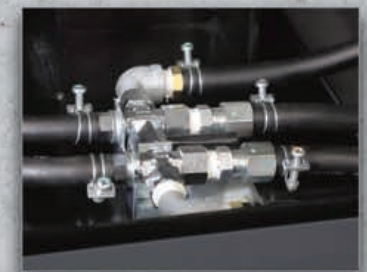
10 | External Fuel Tank Connections with 3-Way Selection Valve

BEST-IN-CLASS dBA RATING // 24-HOUR RUNTIME // EXCELLENT MOTOR STARTING THE INDUSTRY'S HIGHEST-QUALITY MOBILE GENERATORS