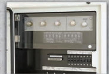
3 | Large Electrical Output Lugs 3Φ Output - 480V & 240V or 208V