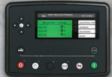
1 | DSEgenset® Digital Control Panel Model 7310 MKII