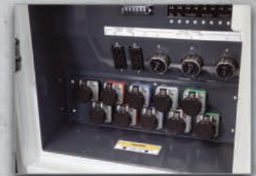
2 | Single-Phase Receptacles 120V - 20A x 2 - | 240V - 50A x 3 Optional Dual Row Cam-Loks™ Shown