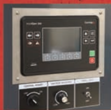
Paralleling Control Panel