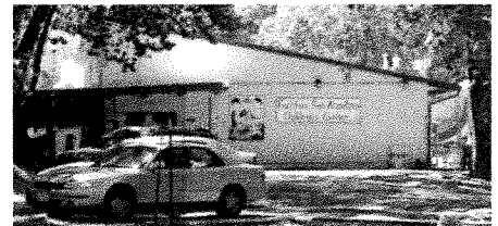
The 50-year old facility needs major renovations.

There is a commitment that, after the property transfer, the facility and campus renovations will commence. The childcare facility needs major renovations to address deferred maintenance and ensure future seismic and fire safety for long-term sustainability.