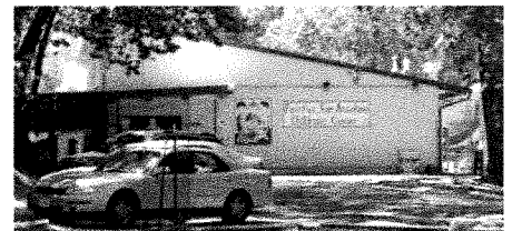
The 50-year old facility needs major renovations.

There is a commitment that, after the property transfer, the facility and campus renovations will commence. The childcare facility needs major renovations to address deferred maintenance and ensure future seismic and fire safety for long-term sustainability.