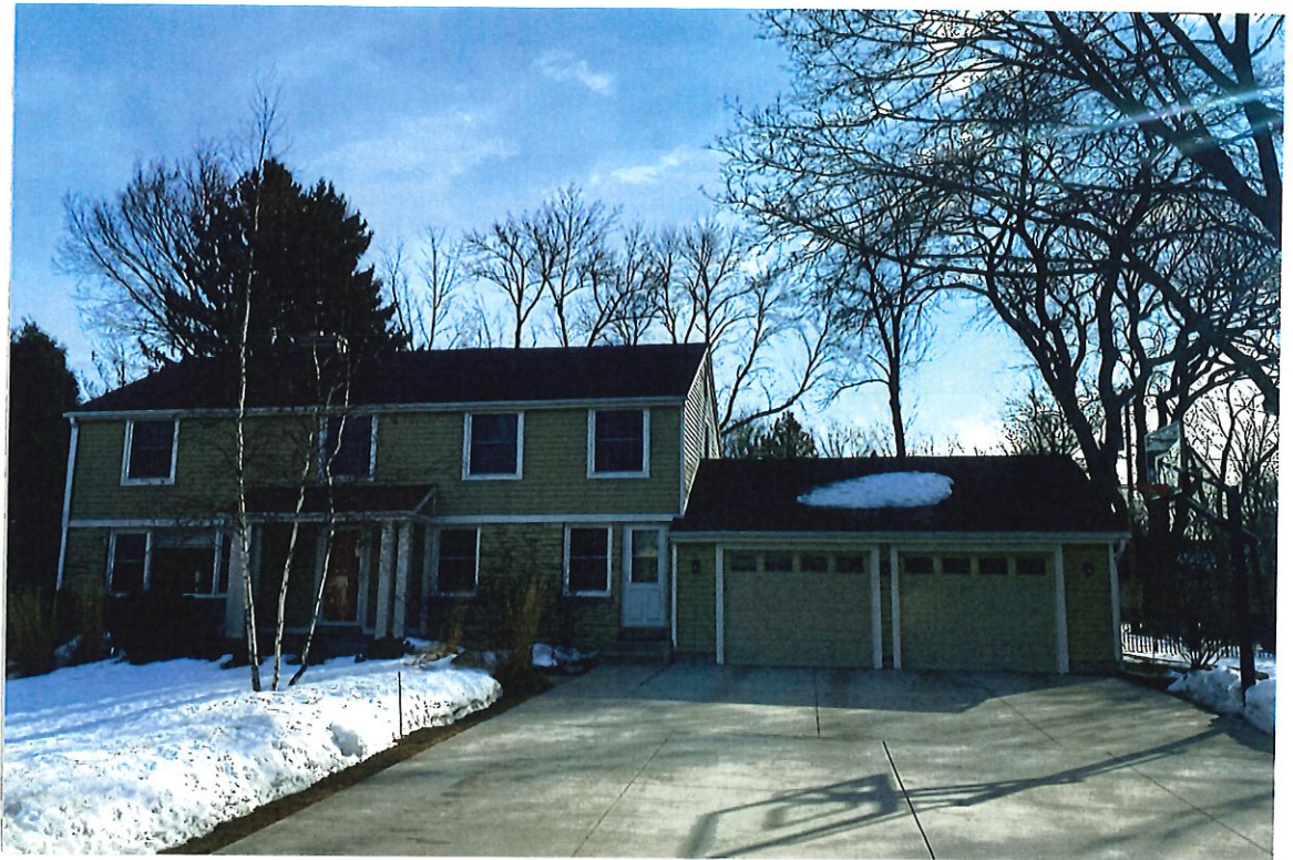
Picture of existing home