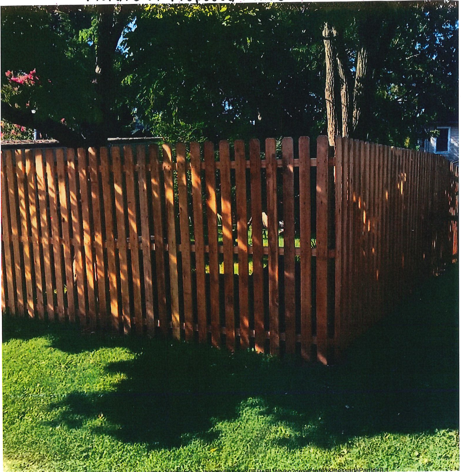
Picture of Proposed Fence

https://mail.google.com/mail/u/0/?ui=rm&enl#https://kibx7ch7k1kktzkiBk1kxcXREPoBl_Wvbn2projectof1&messageParId=0.1