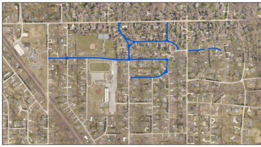
2022 PAVEMENT RESURFACING PROGRAM VILLAGE OF BAYSIDE, WI