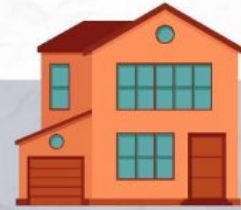
MULTI STORY HOMES (Modern Multi Story)

Multiple Levels Relatively Expensive Smaller Buyers Market Less Demand Expensive Maintenance Higher Utility Costs