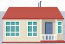
RANCH HOMES (Modern Single Story)

Let's compare the two most common styles and explain why some homes are increasing at faster rates than others: