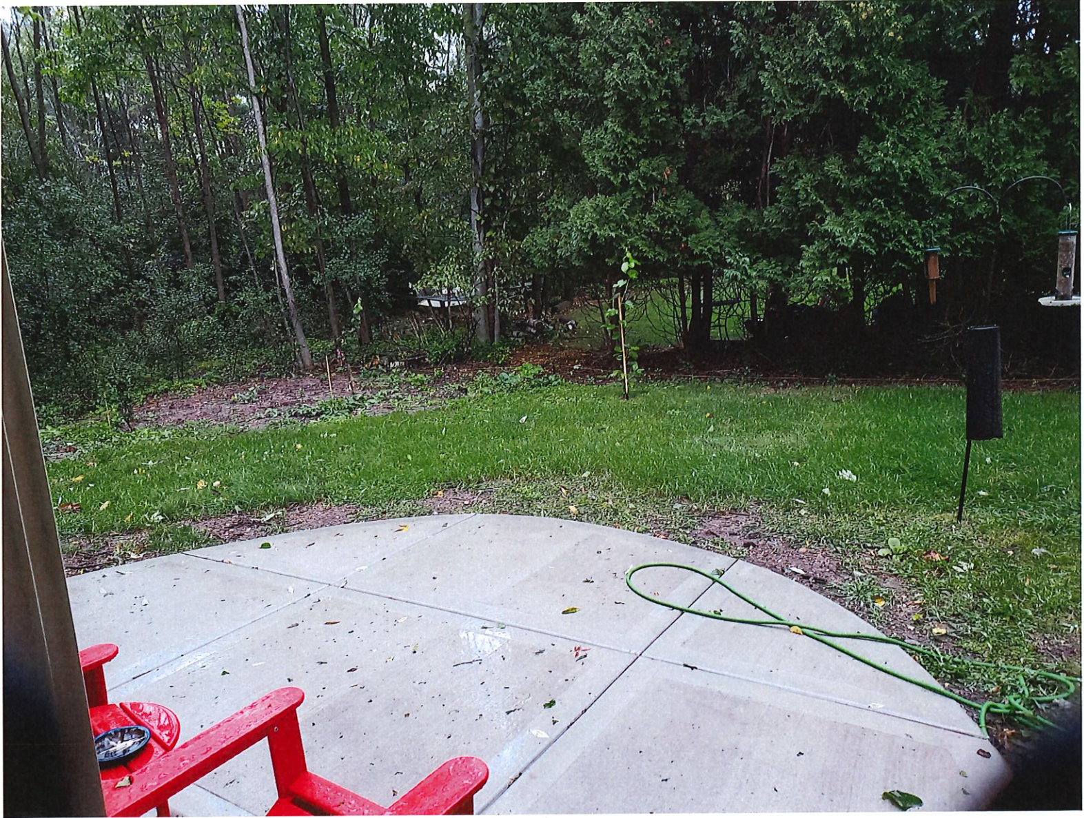
Picture of current Backyard