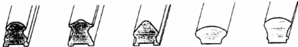
Type II Handrails

2. Type II. If over 6 1/4" around graspable portion, requires a finger recess area on both sides of the handrail. Recess starts within 3/4" from the top of the handrail, at least 5/16" deep within 7/8" of the widest portion. Recess at least 3/8" high and extends to at least 1 3/4" from the top of the handrail. Width above recess must be 1 1/4" to 2 3/4". Minimum edge radius of 0.01". [Accessibility Guideline requires minimum 1 1/4" and maximum 2 1/4" dimensions on handrails.]