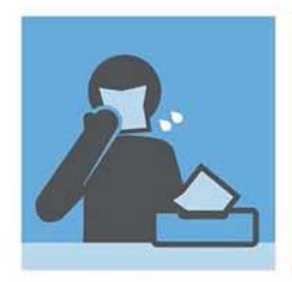
COVER YOUR MOUTH WITH A TISSUE OR SLEEVE WHEN COUGHING OR SNEEZING