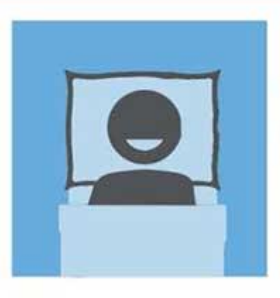
GET ADEQUATE SLEEP AND EAT WELL-BALANCED MEALS