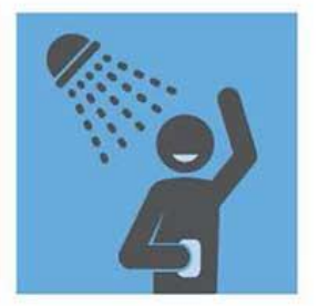
PRACTICE GOOD HYGIENE HABITS