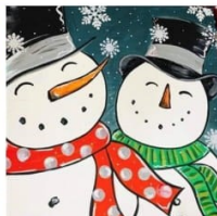
SNOW FAMILY December 13 6:00 pm - 8:00 pm