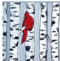
WINTER CARDINAL January 10 6:00 pm - 8:00 pm