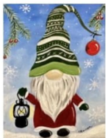
GNIGHT BEFORE XMAS December 6 6:00 pm - 8:00 pm

No experience required. $25 per painting.