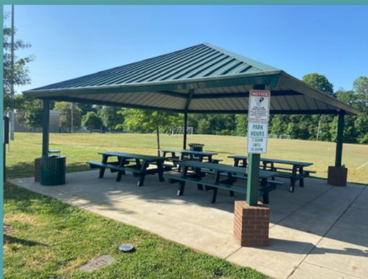
EBB GANTT PICNIC SHELTER