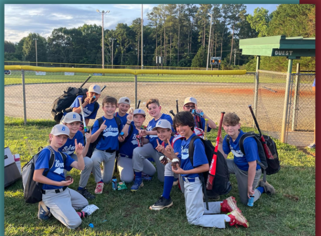
SPRING 2022 12U CHAMPIONS!

https://parksrec.egov.basgov.com/belmont