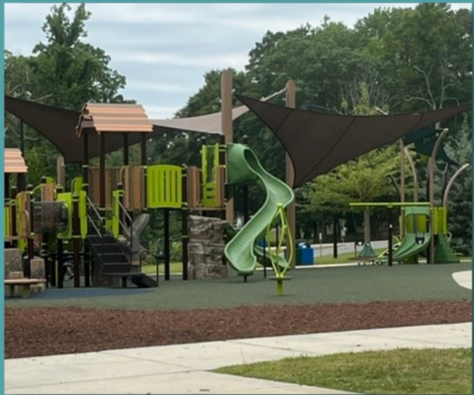
NEW KEVIN LOFTIN PLAYGROUND

The new Kevin Loftin playground renovations are complete and the playground is already being well used! Due to delays in delivery of materials, we are still waiting for the fence to be re-installed.