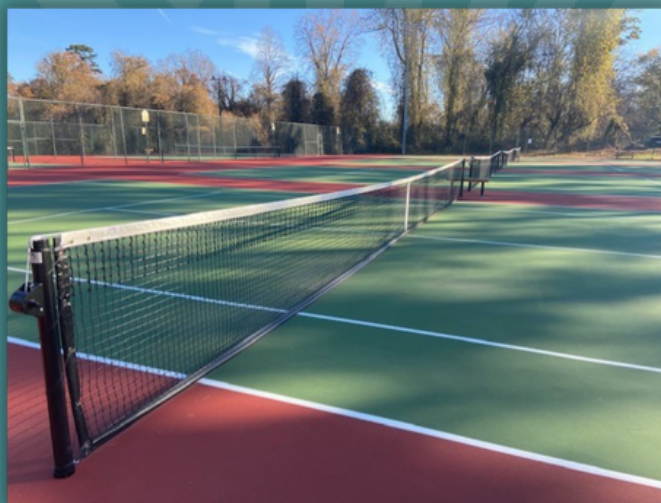
DAVIS PARK PICKLEBALL COURTS

To make a court reservation, go to www.courtreserve.com or go onto the Court Reserve App. The app is available on all IOS and Google devices.