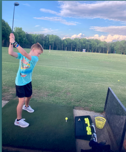
2022 SUMMER JR. GOLF

Dance Expressions and our gymnastic programs have held several camps and classes this summer. Even during our "slower" months, we have remained busy, busy, busy!