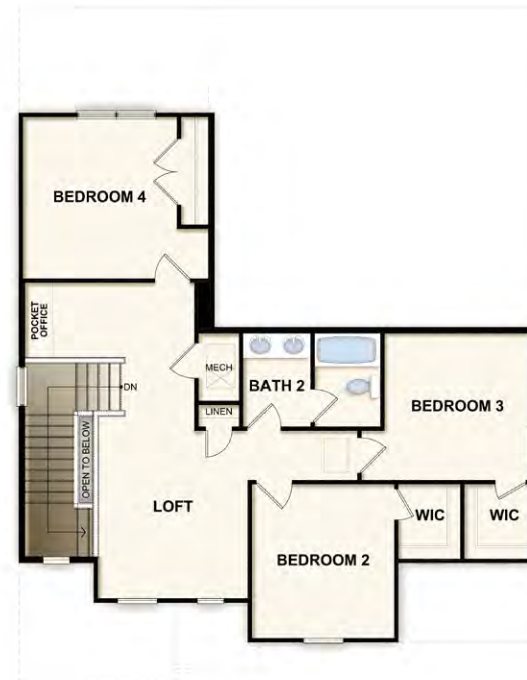
SECOND FLOOR PLAN BASE ELEVATION SHOWN