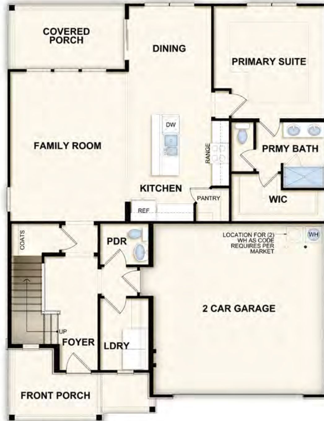
FIRST FLOOR PLAN BASE ELEVATION SHOWN