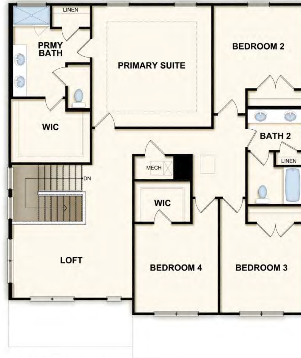
SECOND FLOOR PLAN BASE ELEVATION SHOWN