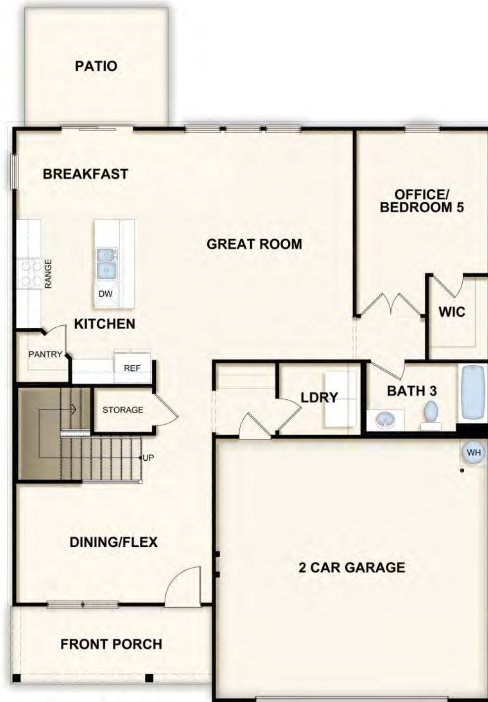
FIRST FLOOR PLAN BASE ELEVATION SHOWN