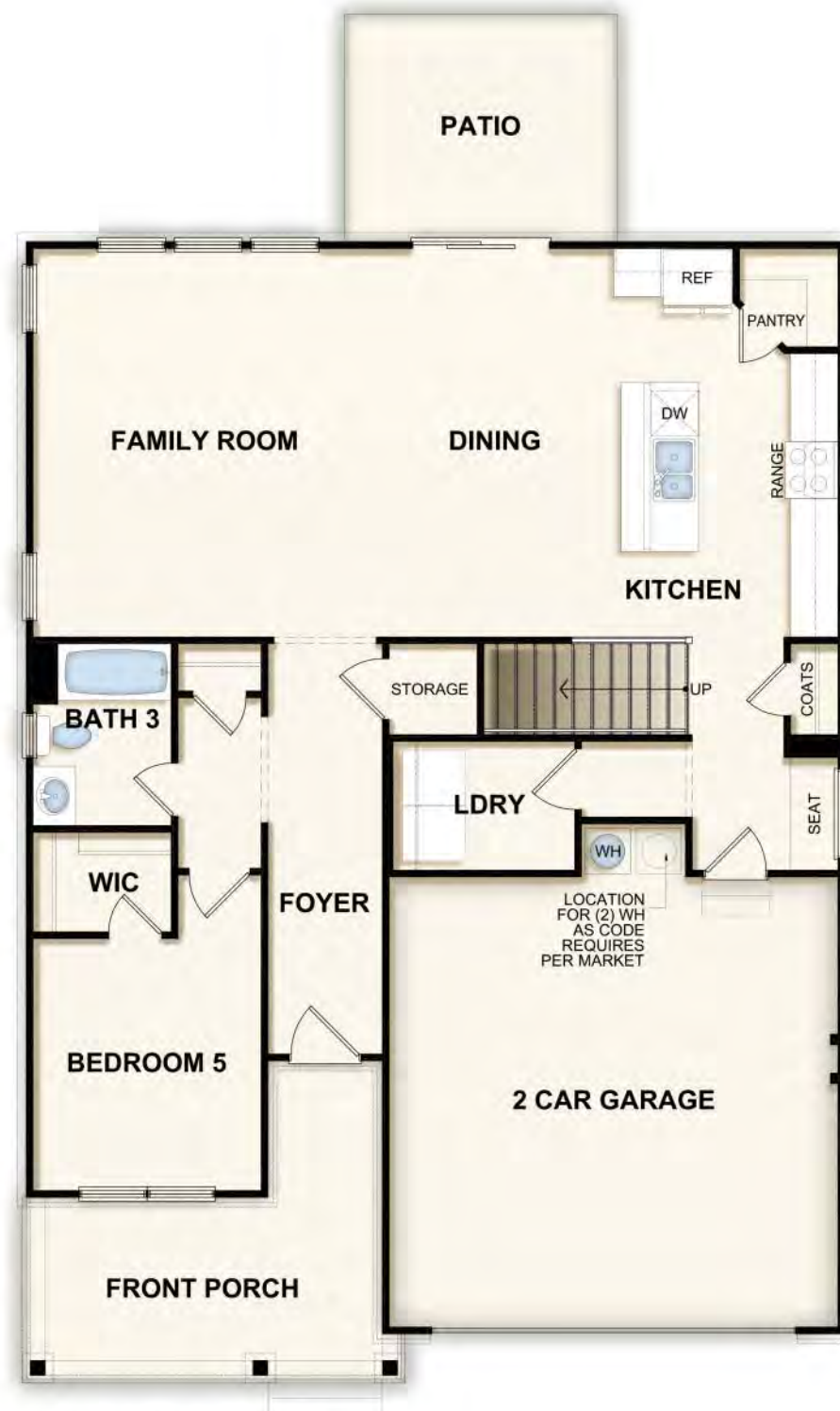
FIRST FLOOR PLAN BASE ELEVATION SHOWN