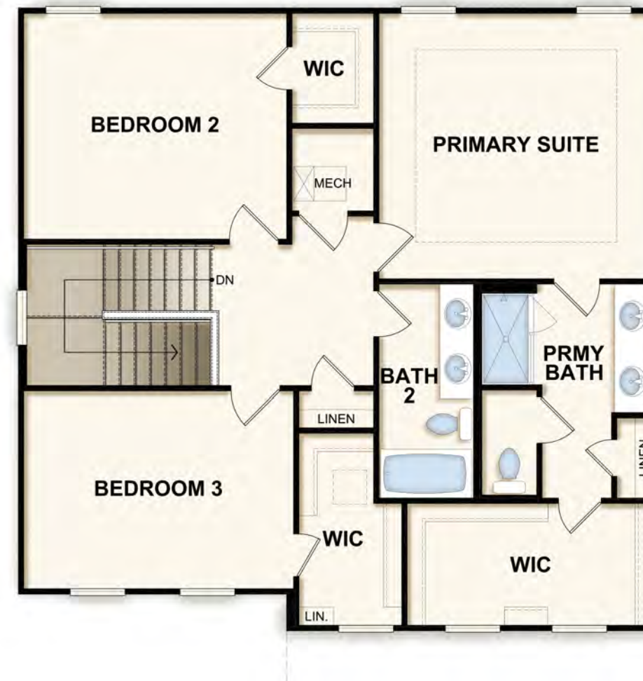
SECOND FLOOR PLAN BASE ELEVATION SHOWN