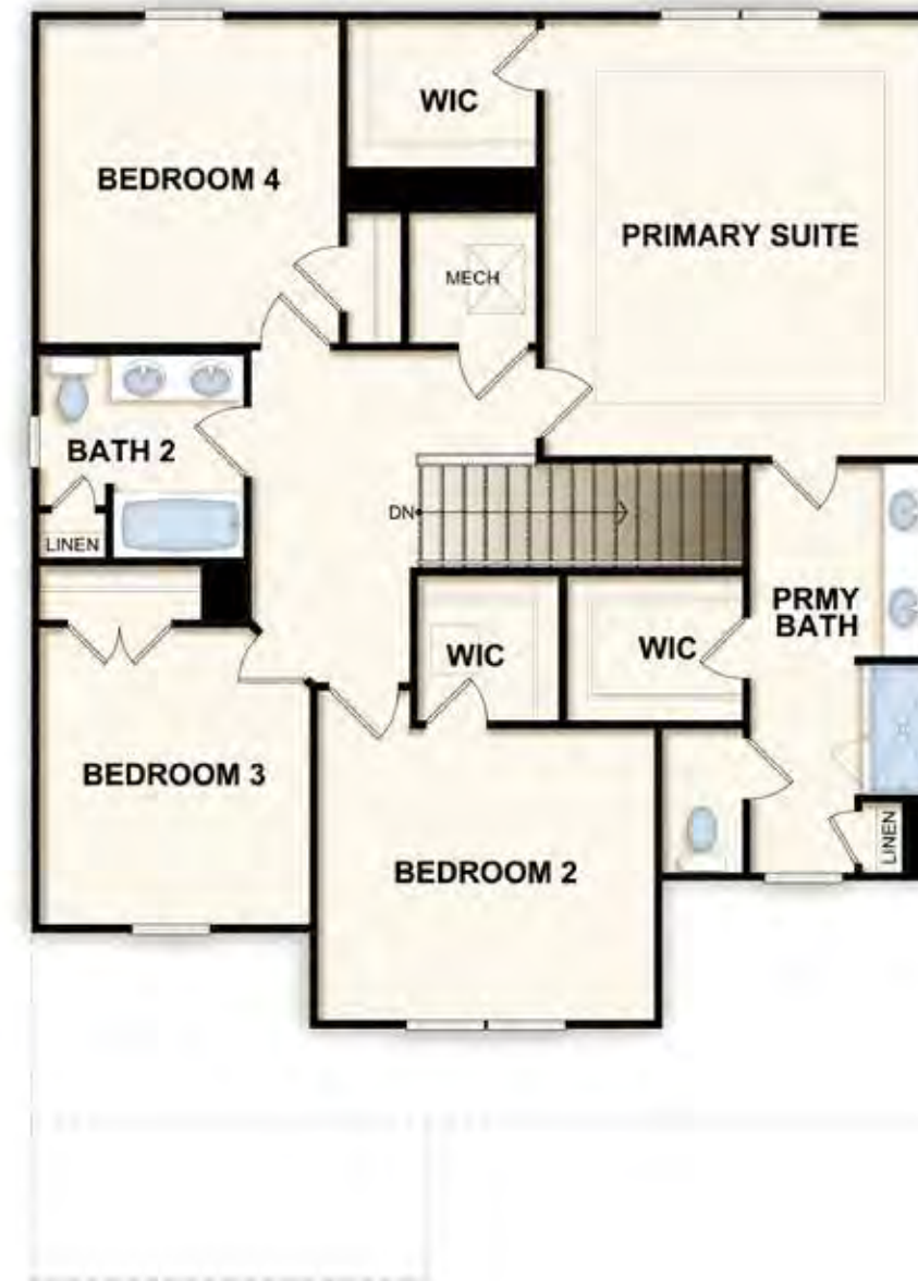
SECOND FLOOR PLAN BASE ELEVATION SHOWN

Plan 35-Eisenhower Frame Slab v2.6 2 Story | 4 Bedroom | 2.5 Bath | 2 Car Garage 1st Floor 9' Ceilings | 2nd Floor 8' Ceilings with Vinyl Plank Flooring throughout