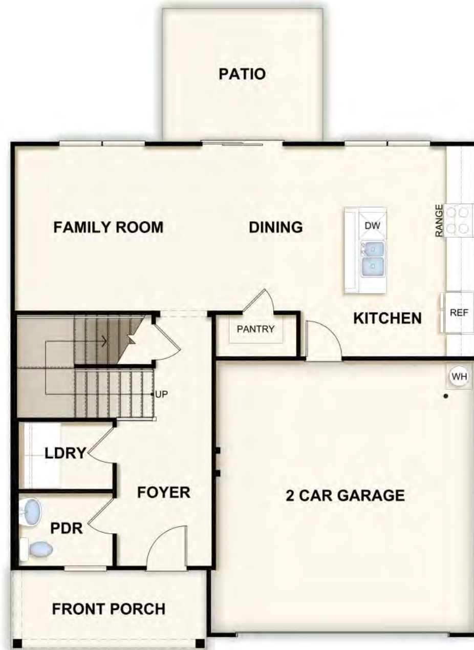
FIRST FLOOR PLAN BASE ELEVATION SHOWN