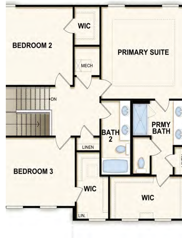
OND FLOOR PLAN ELEVATION SHOWN