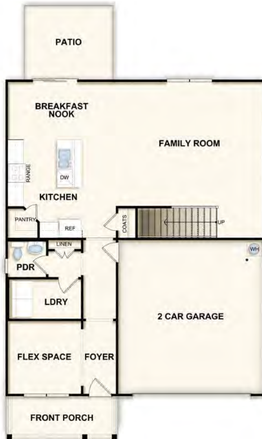
FIRST FLOOR PLAN BASE ELEVATION SHOWN