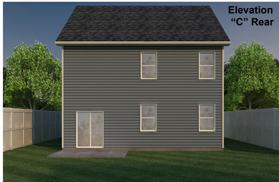
Elevation "C" Rear