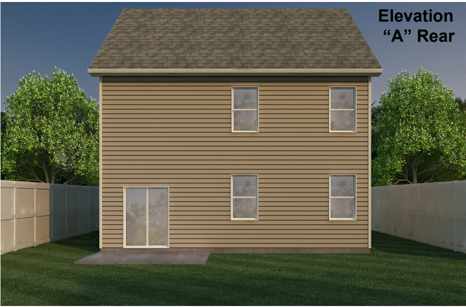
Elevation "A" Rear