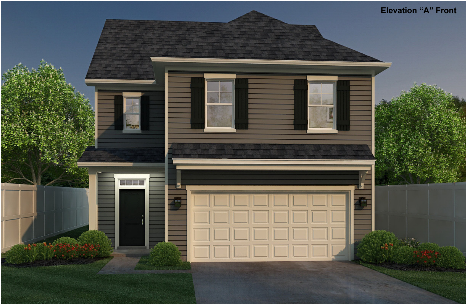
Elevation "A" Front