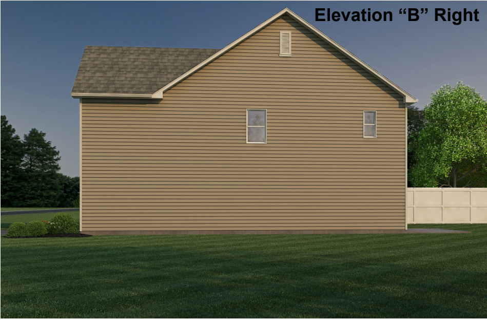
Elevation "B" Right