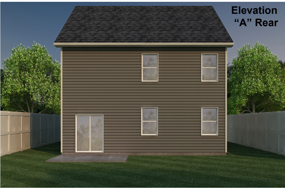
Elevation "A" Rear