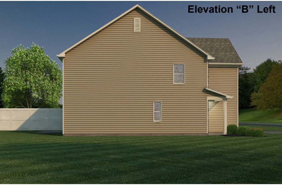
Elevation "B" Left