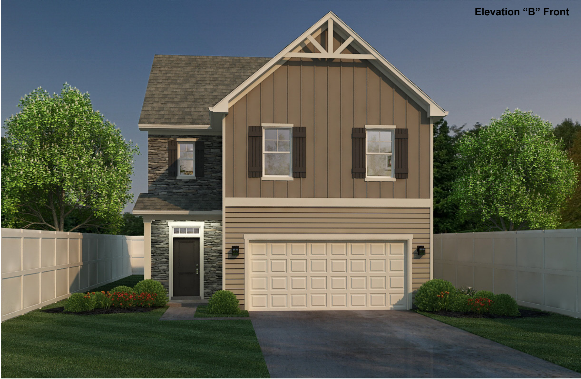
Elevation "B" Front