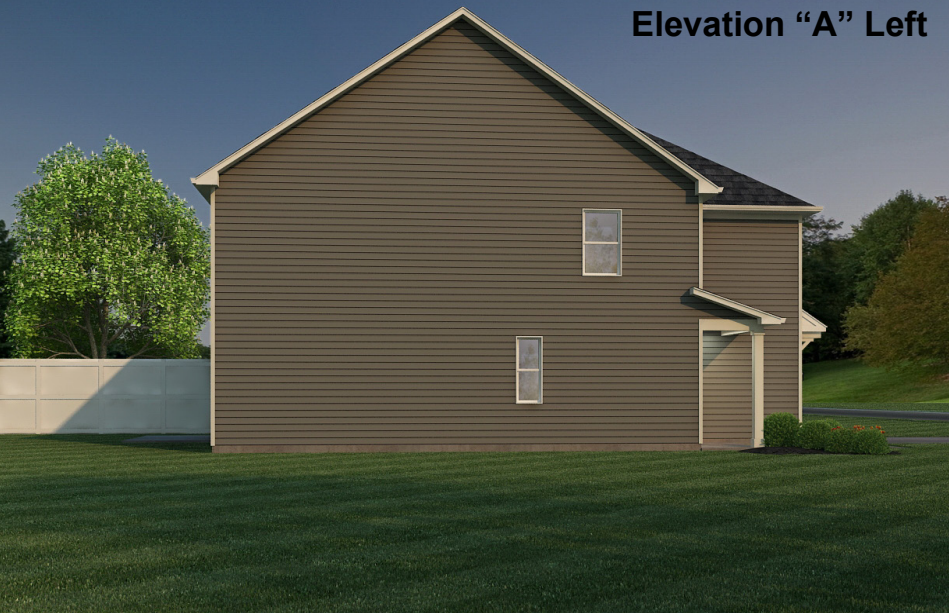
Elevation "A" Left