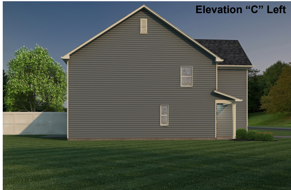
Elevation "C" Left