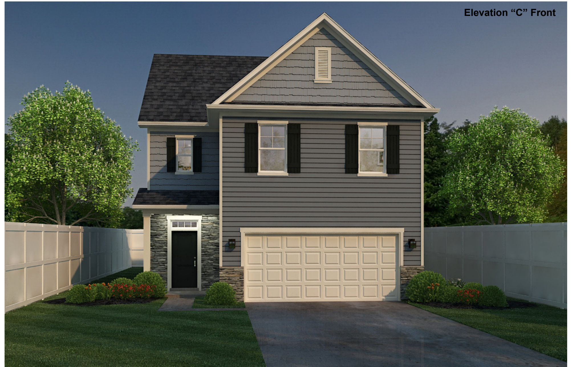
Elevation "C" Front