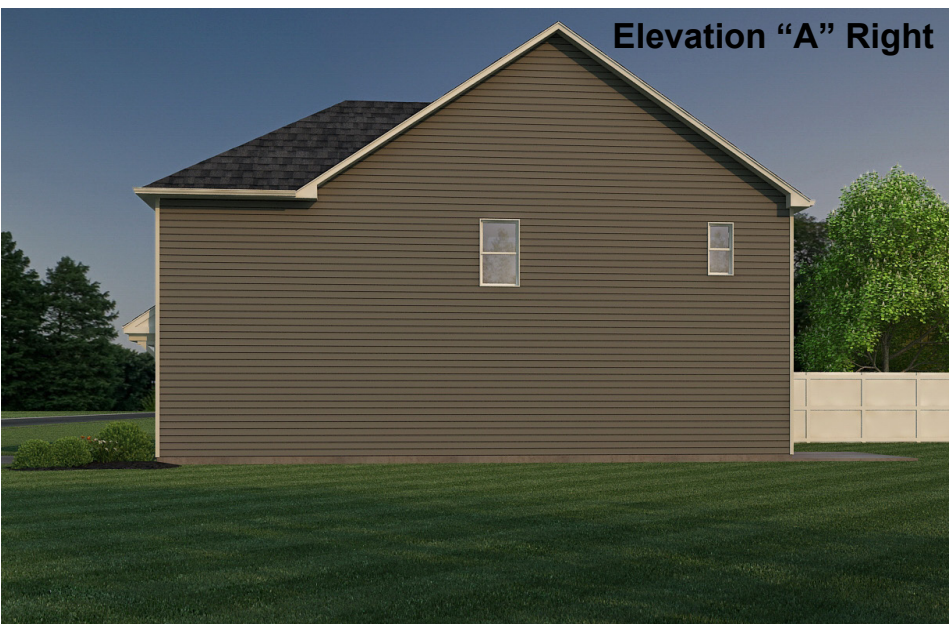
Elevation "A" Right