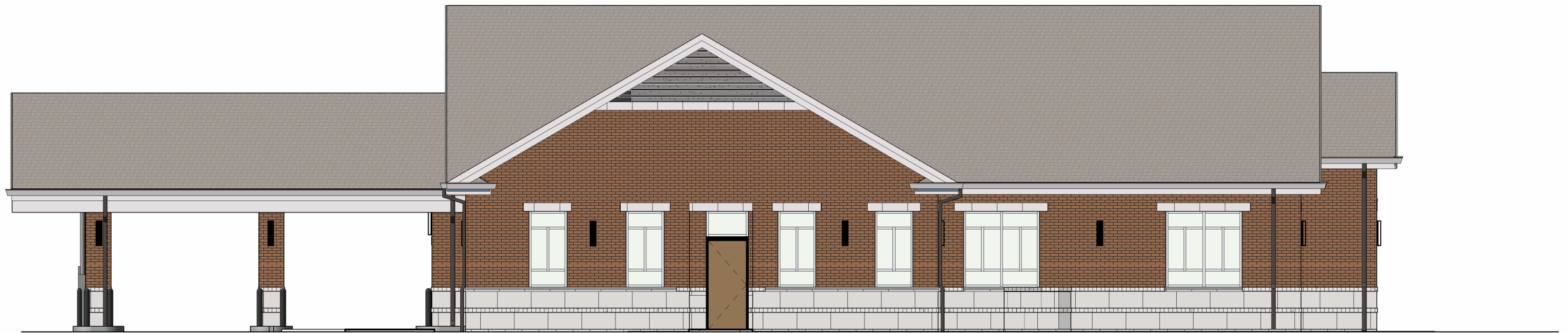
2 ELEVATION 2 Scale: 1/8" = 1'-0"