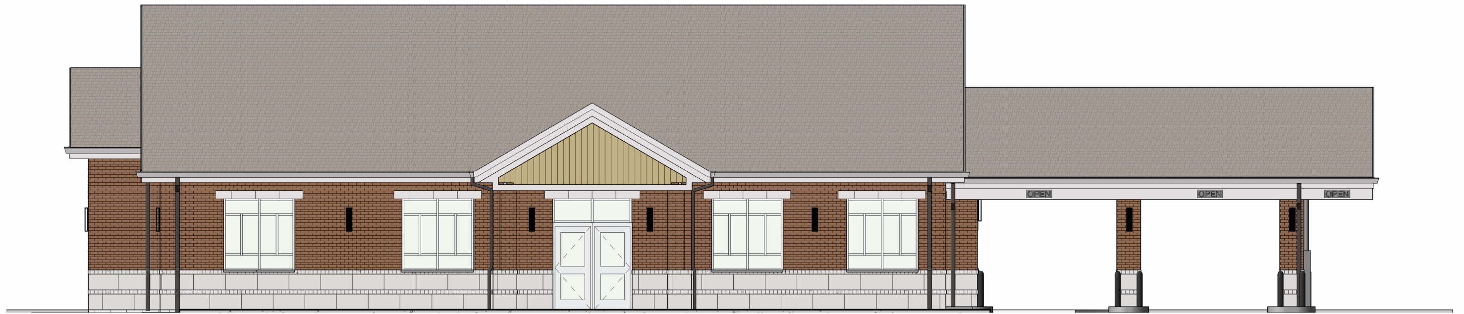
1 ELEVATION 1 Scale: 1/8" = 1'-0"