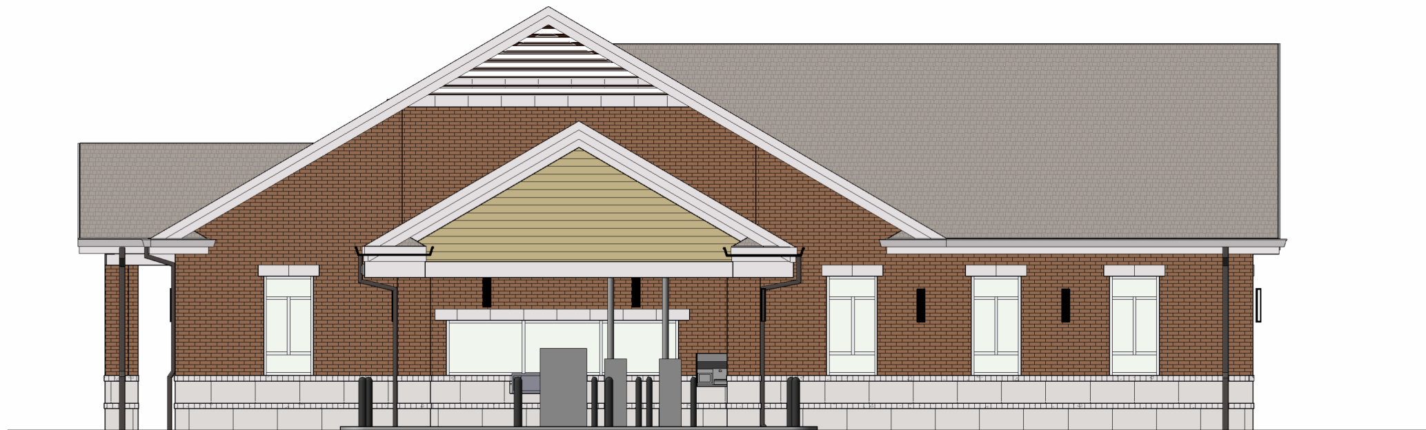
2 ELEVATION 4 Scale: 1/8" = 1'-0"