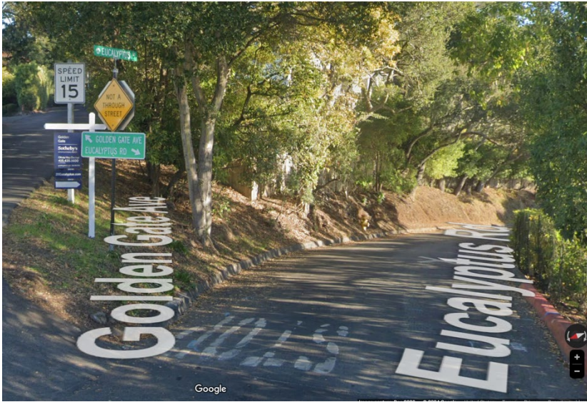
Figure 2.A Eucalyptus Road at Golden Gate

Currently, public parking on Eucalyptus Road is somewhat unstructured. It's been reported that contractors and service providers often park in areas that create traffic constraints. In October of 2023, the City received a petition ( attachment A ) from a majority of Eucalyptus Road residents requesting that the red no-parking curb at the Golden Gate/Eucalyptus Road intersection be extended beyond 4 Eucalyptus (approx. 362 linear feet).