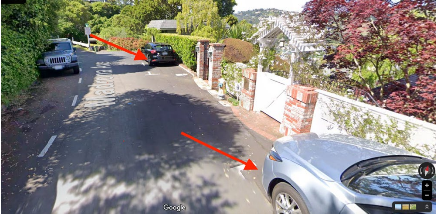
Figure 1.A Referenced Public Parking Boxes Proposed for Removal