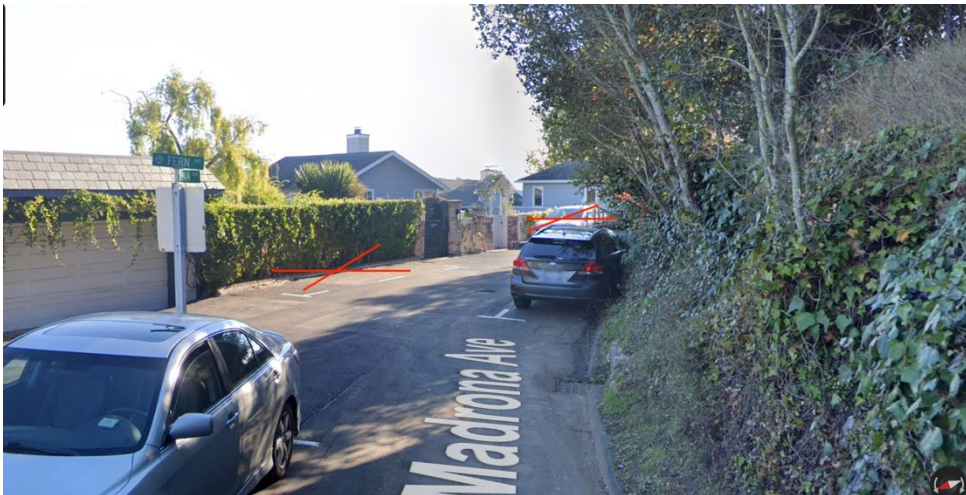
Figure 1.B Fern and Madrona Intersection looking southeast.

For the reasons cited above, staff agrees with the property owner's request to remove the two parking boxes fronting 230 and 240 Madrona. In granting this request, it's also recommended that the Committee consider increasing the size of the public parking box directly opposite 230 and 240 Madrona. This will ensure that those who utilize this remaining area are not violating the city's parking ordinance.