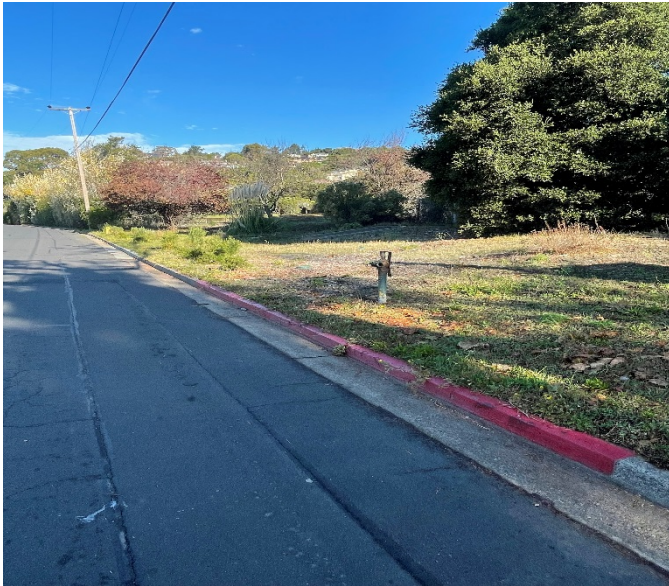
New plantings on Lagoon Road - Grevillea