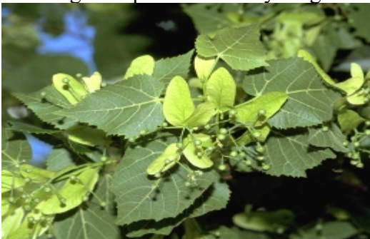
Fruit, foliage, and seeds of linden

Lindens are often planted as a lawn, patio, or street tree. They can also be shaped into hedges. They do well in areas with full sun and in rich, moist soil. Provide regular watering. Shape trees when young. Prune older trees as needed.