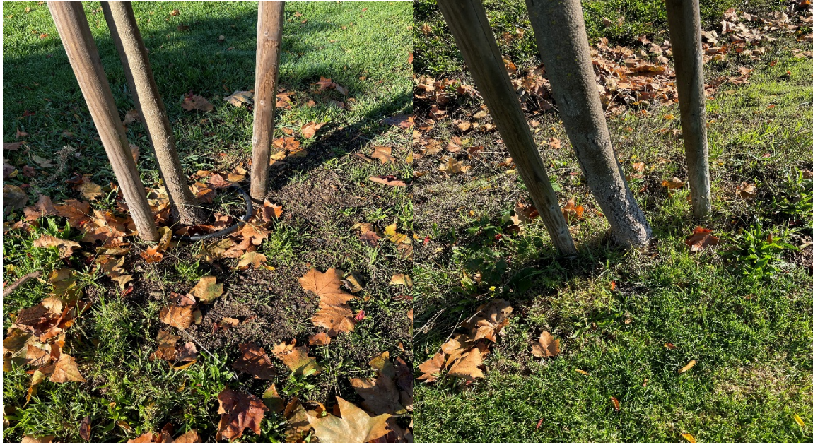
Irrigation too close to tree and remove poles.

supply. Well water, recycled water and other alternative water sources are an approved option for new plant material". POSC may wish to review well water capacity given new plantings on Lagoon Road and before considering further plantings.