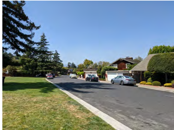
Belvedere Park lacks a sidewalk and crosswalk access to the north side of Community Road