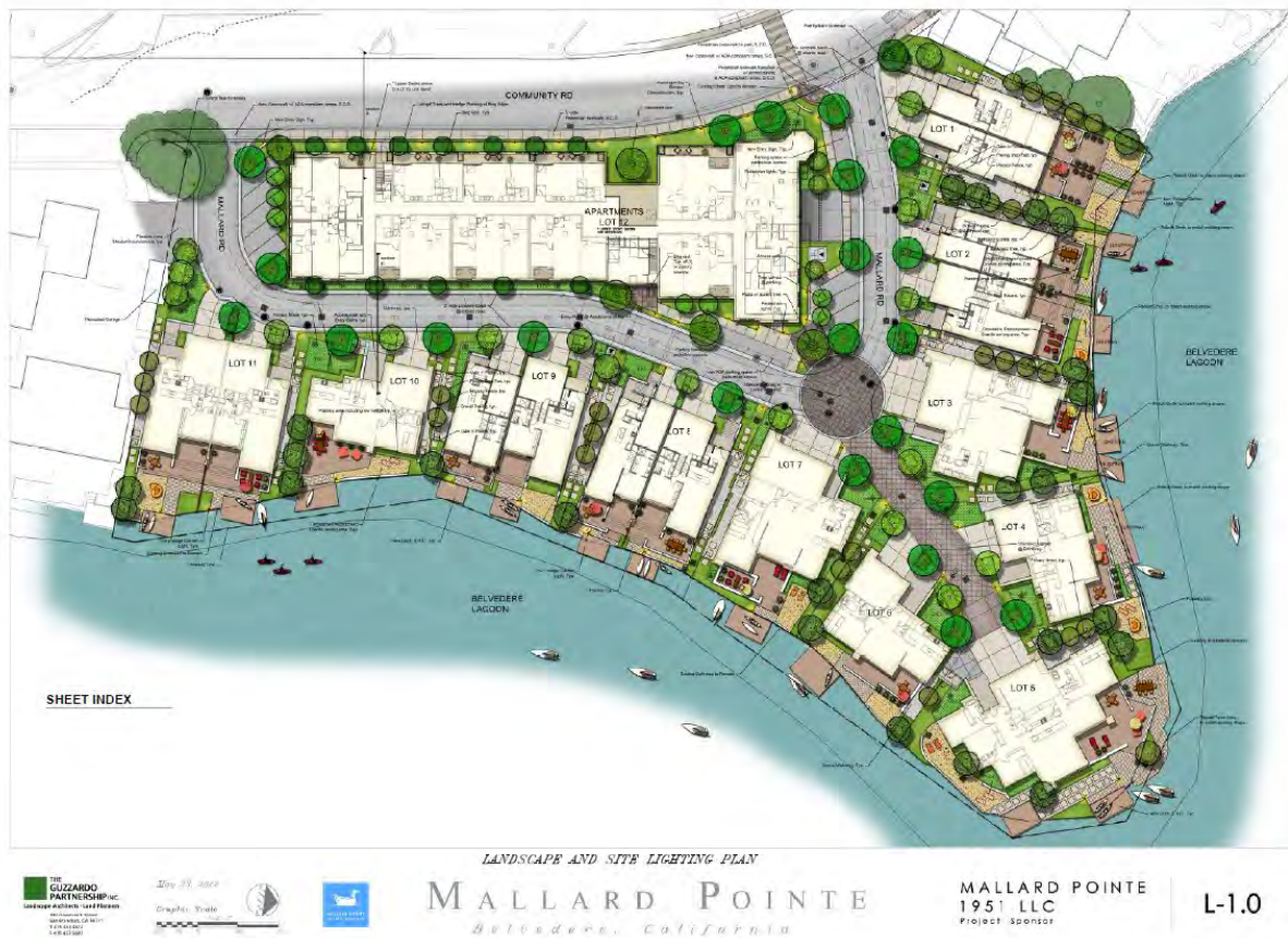
Figure 2. Site Plan