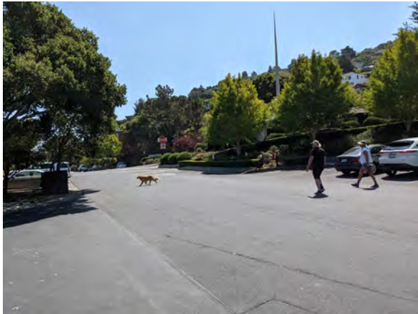
Pedestrians walk in the street on Community Road, which has narrow sidewalks