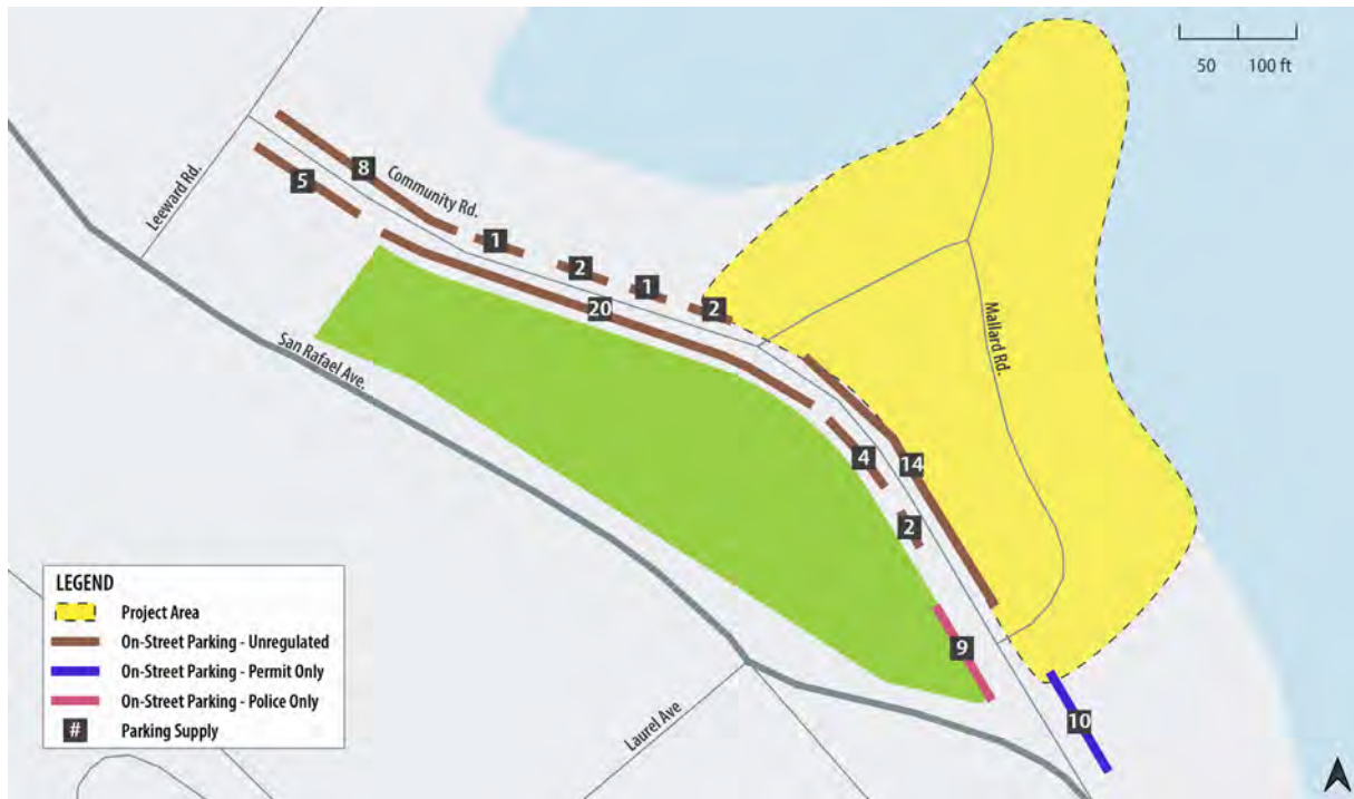
Figure 3. Existing Parking Supply & Regulations