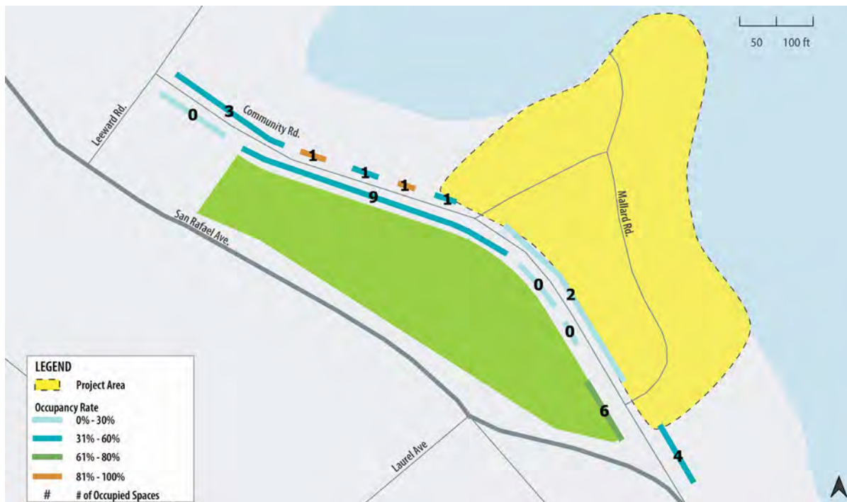
Figure 4. Weekday Evening (7 PM) Parking Occupancy

It would be expected that any parking demand in excess of that associated with the proposed Project could be accommodated with existing on-street parking on Community Road.