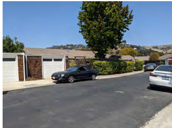
Vehicles park on the rolled shoulder on Mallard Road, restricting pedestrian access