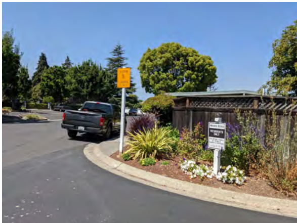
Intersections lack crosswalks and ADA-compliant ramps.