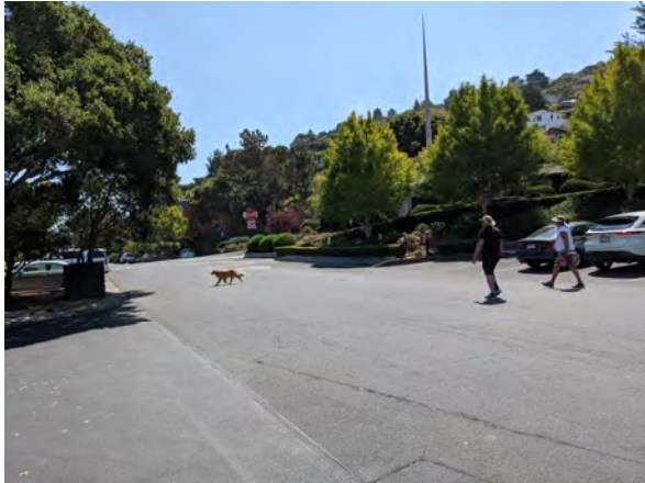
Pedestrians walk in the street on Community Road, which has narrow sidewalks.