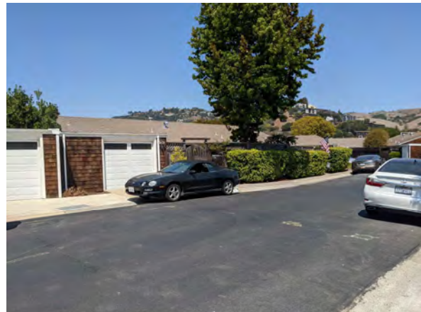
Vehicles park on the rolled shoulder on Mallard Road, restricting pedestrian access.