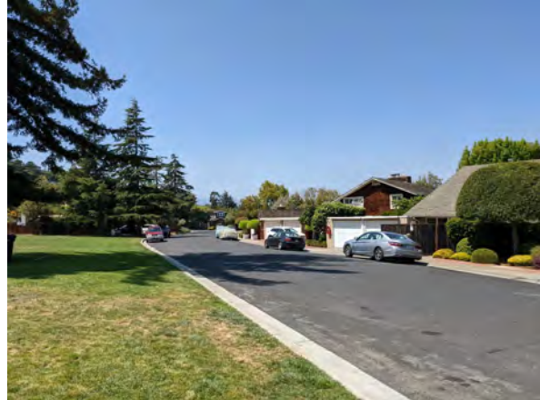
Belvedere Park lacks a sidewalk and crosswalk access to the north side of Community Road.