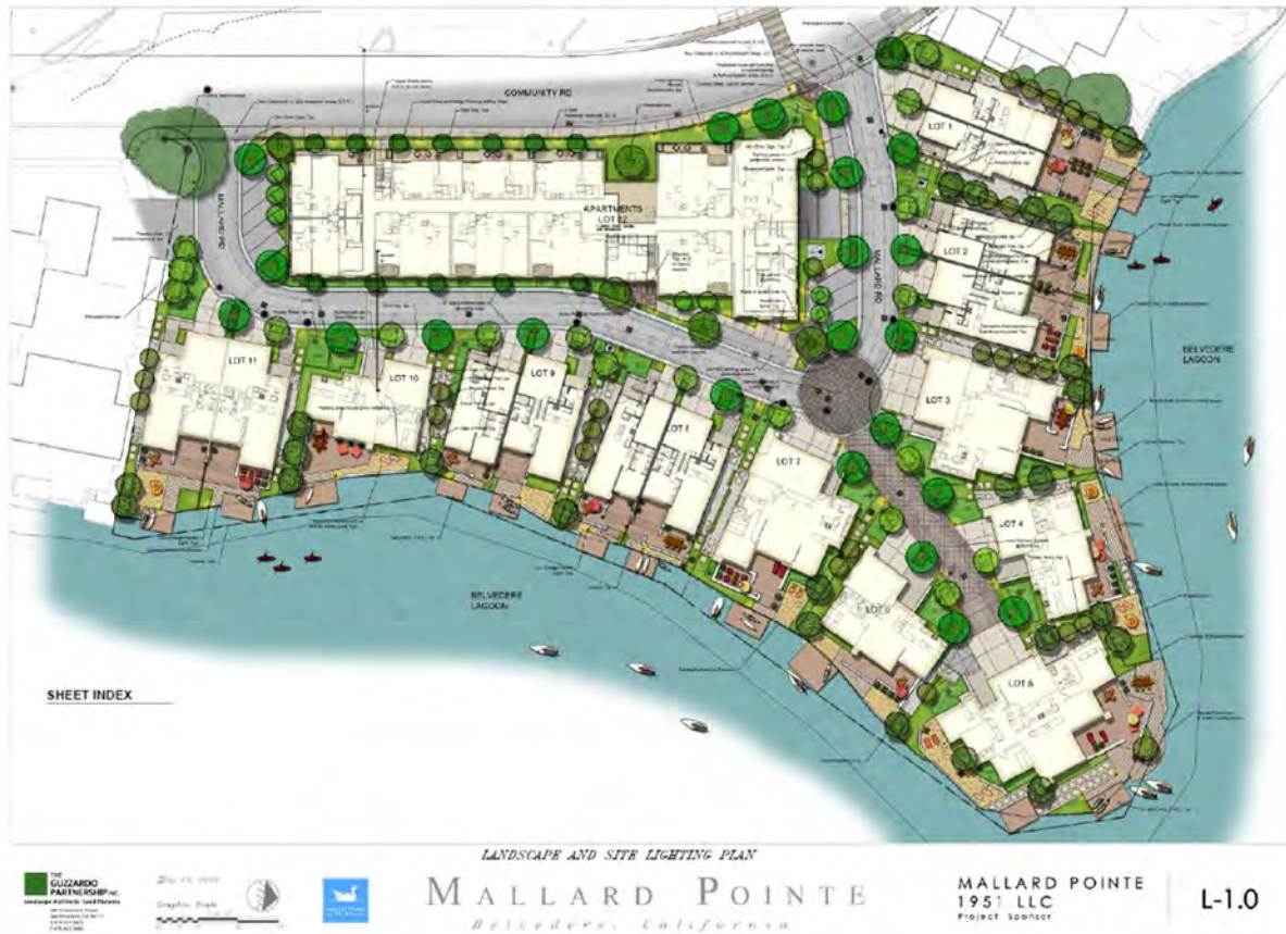
Figure 2. Site Plan