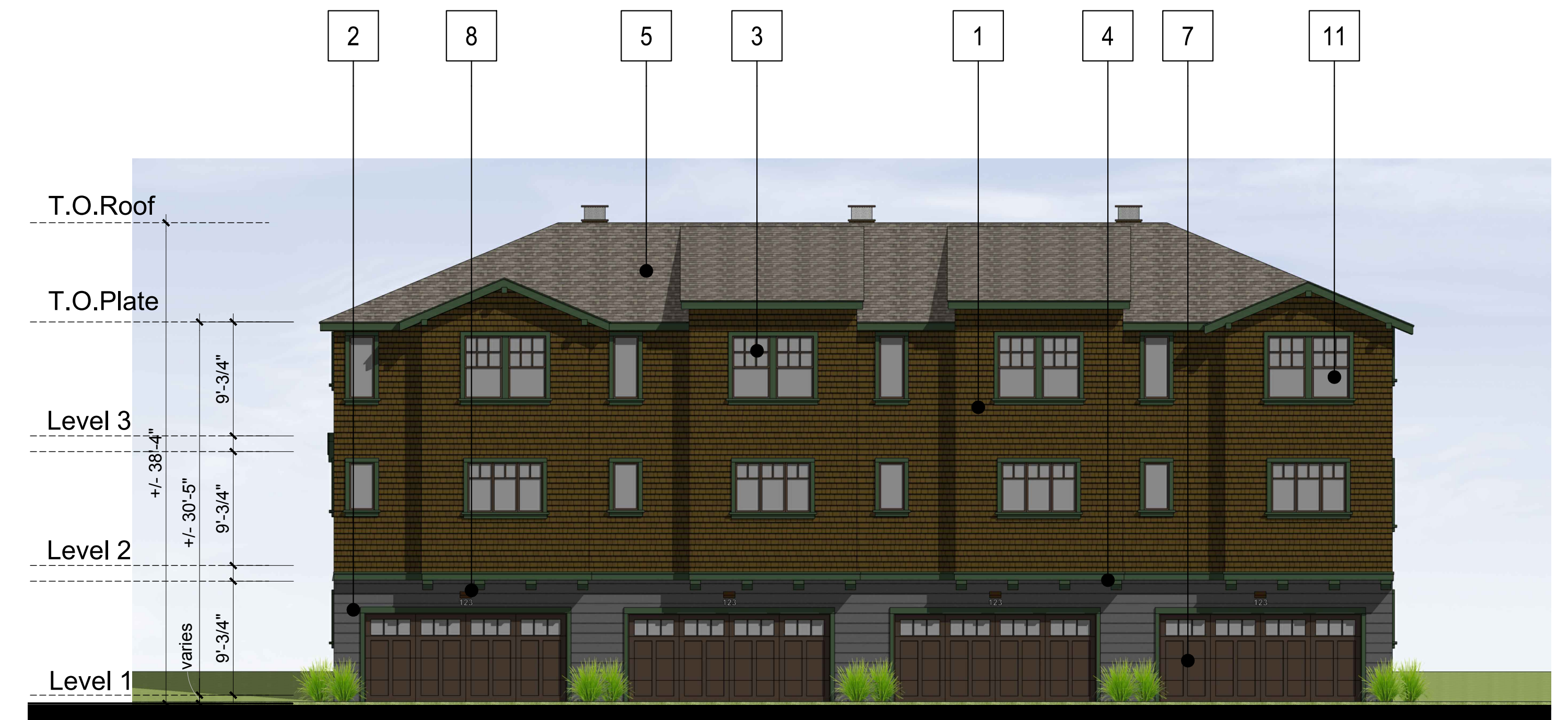
1. REAR ELEVATION