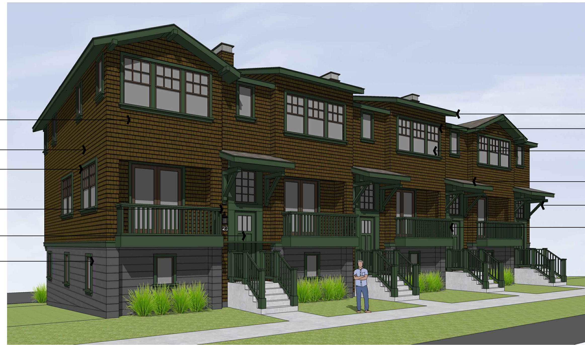
1. BUILDING B - FRONT PERSPECTIVE