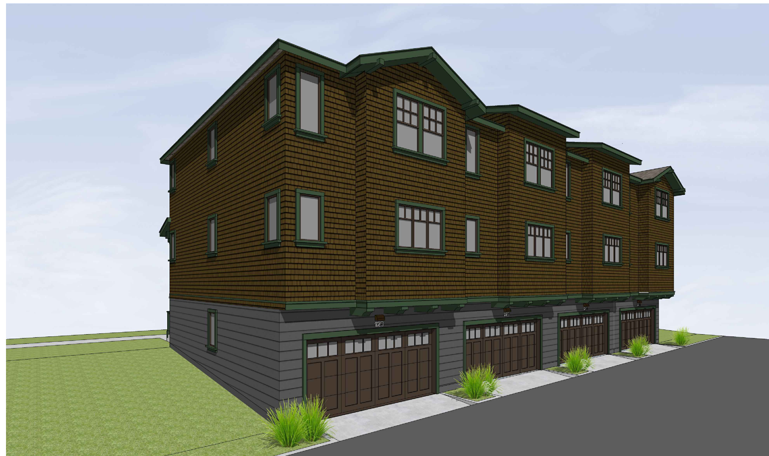
3. REAR RIGHT PERSPECTIVE