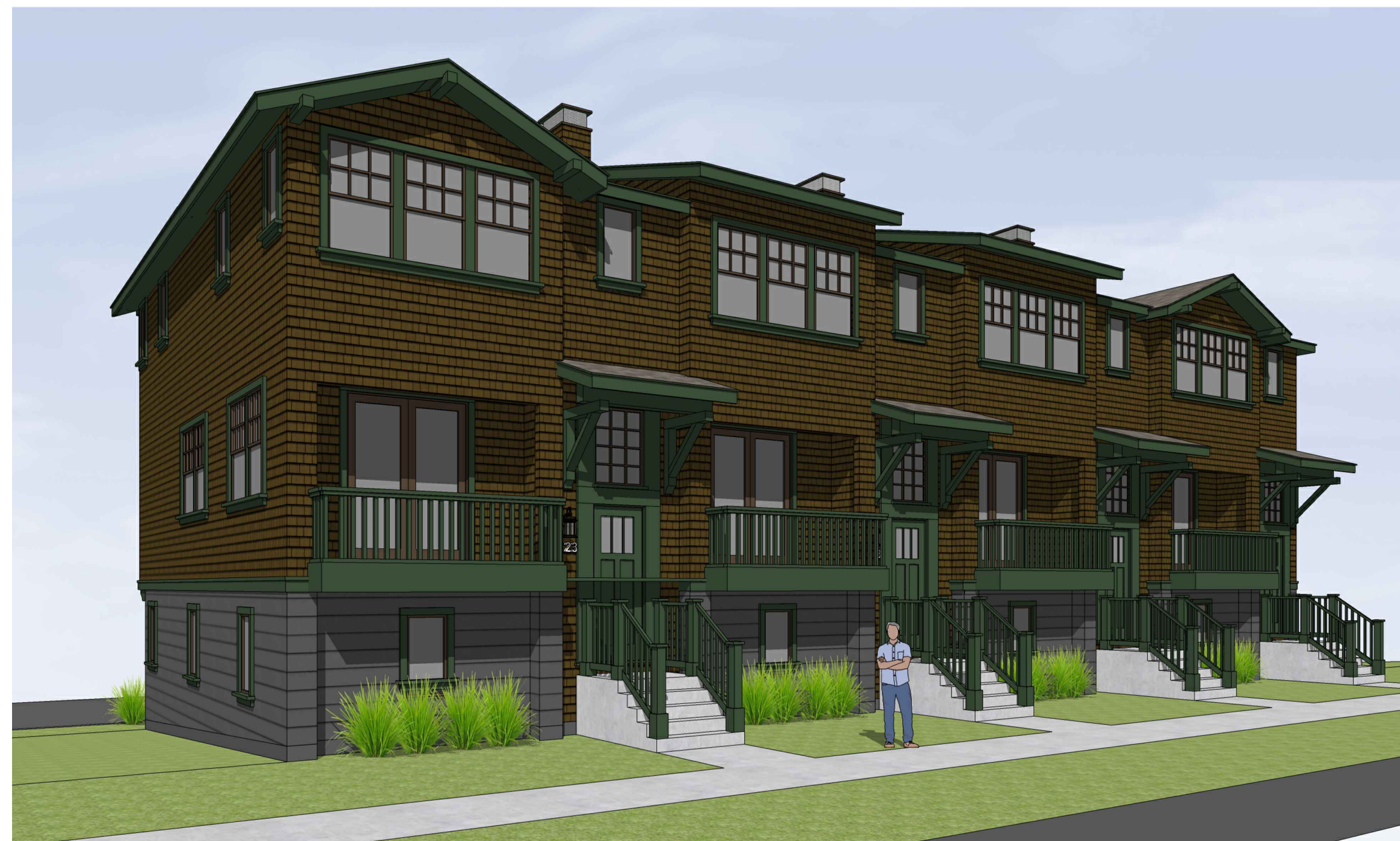
3. FRONT LEFT PERSPECTIVE