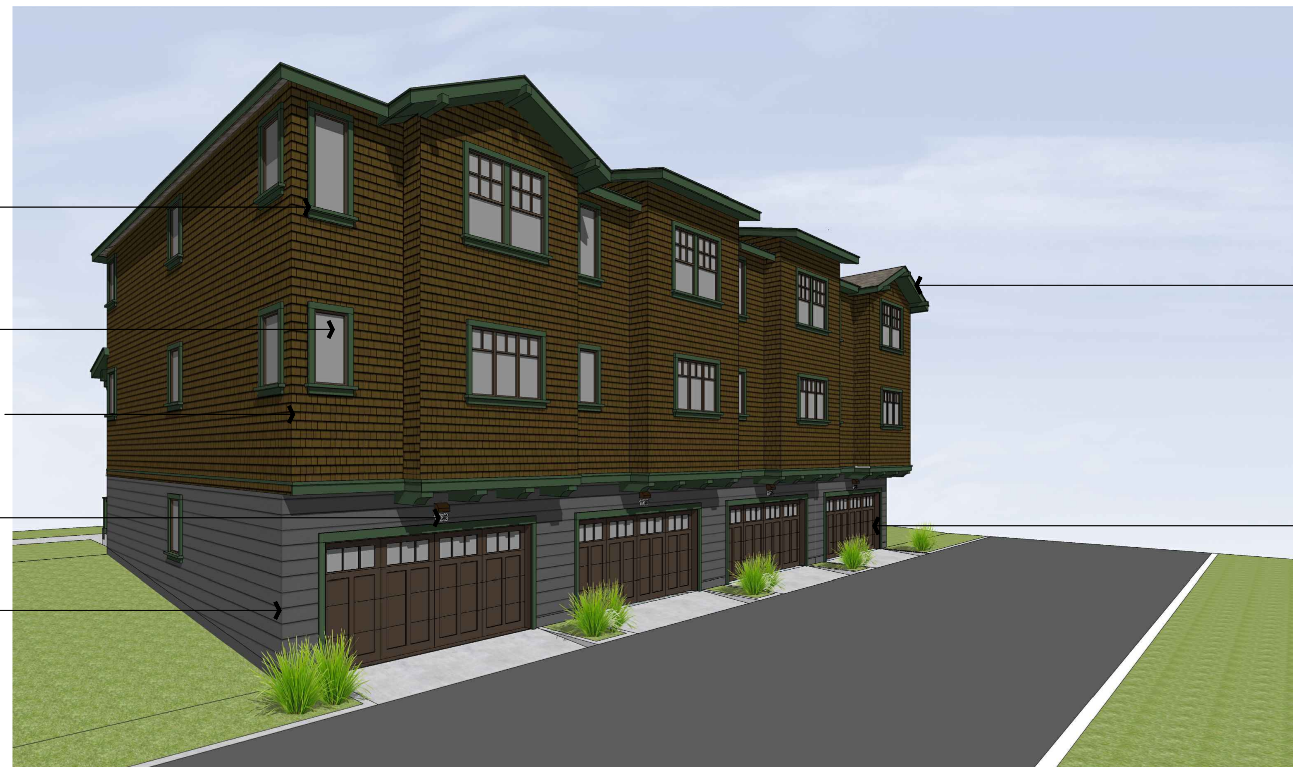
2. BUILDING B - REAR PERSPECTIVE