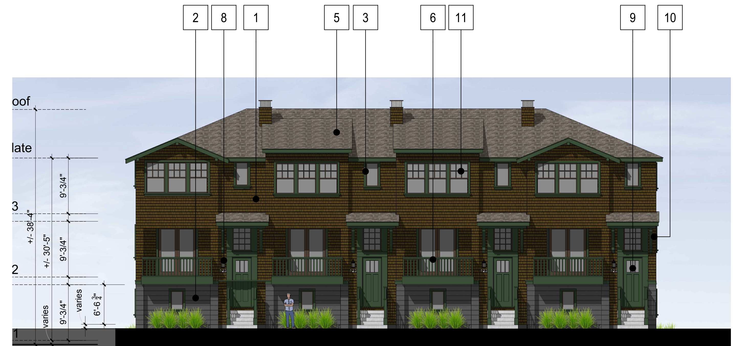
1. FRONT ELEVATION

HD SCHEME – HD BUILDING B – BUILDING ELEVATIONS