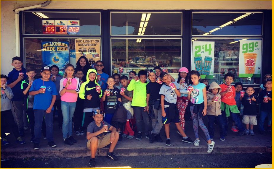
Day Trip, 2017