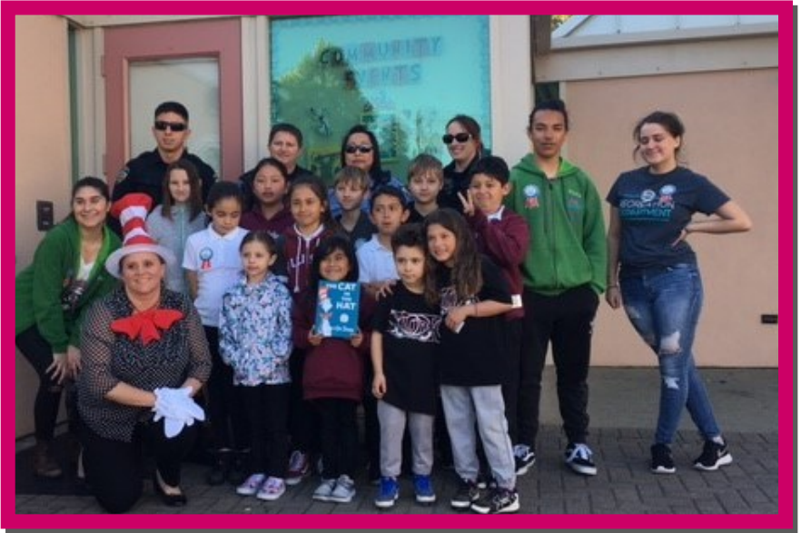
Dr. Seuss Day, 2017