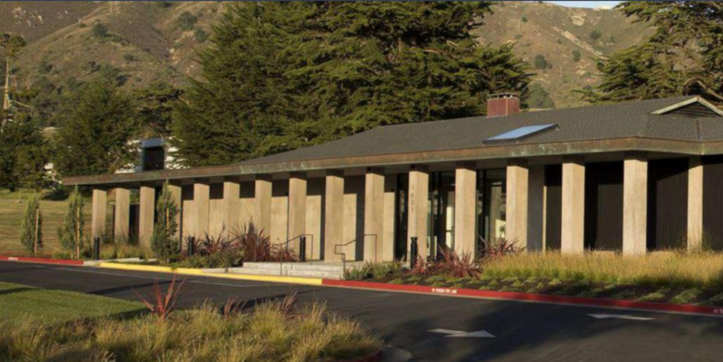
View from NW Corner