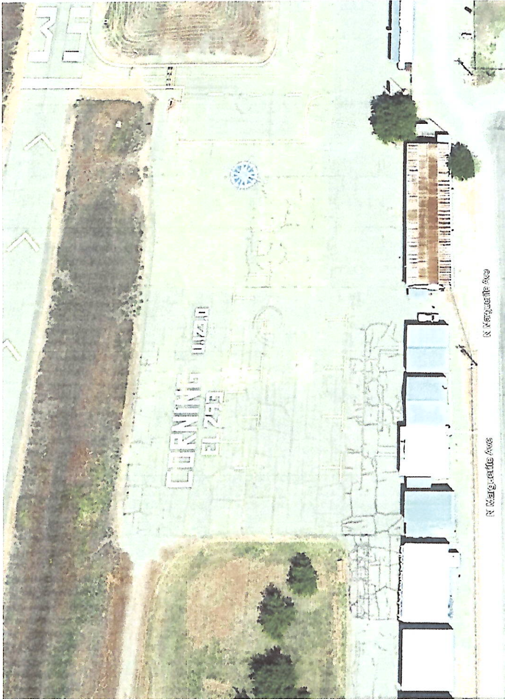
Exhibit B Prepared for City Council Meeting 3/28/2023

From Google Earth 4/28/2021, This area is not scheduled for slurry seal