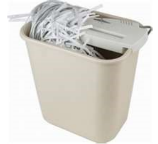
PAPER TO SHRED

This residential recycling event is Co-Sponsored by: