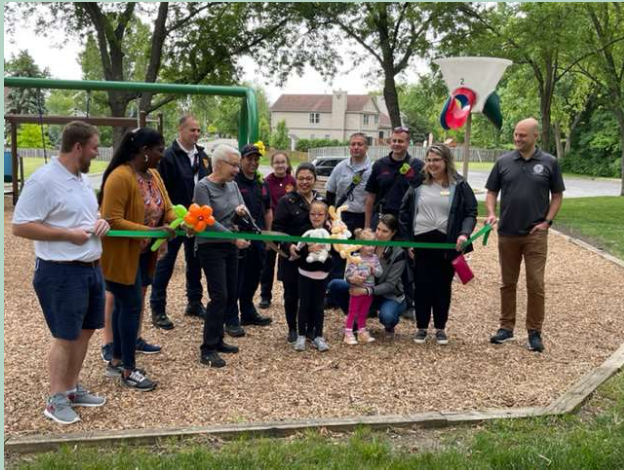
First, we had our ribbon cutting ceremony at our new Knox Park Playground in June.

As the saying goes – time flies when you’re having fun – and this summer went extremely fast! Even though Covid-19 is still around us, it’s great to see group activities return and bring about a familiarity of years past. Thanks to things relaxing, Ela Township has been a flurry of activity - planning and attending several events since our last newsletter.