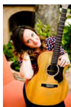
Stolie June 16