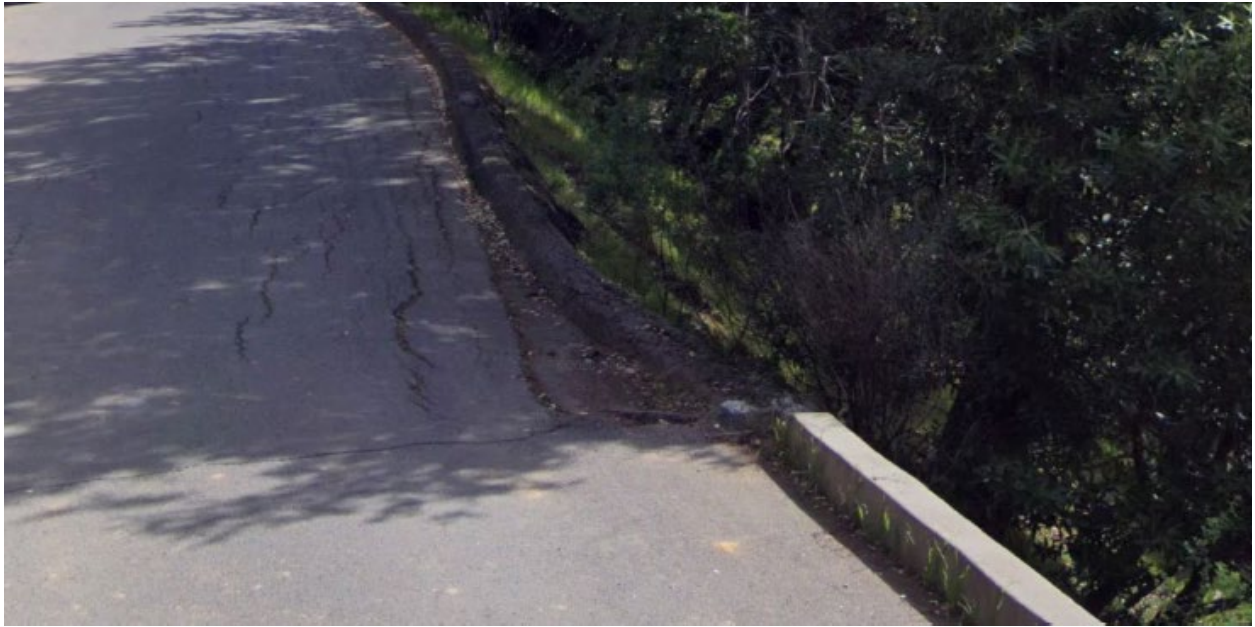
EXHIBIT 1 – 54 PINE DRIVE