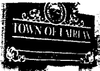
EXHIBIT 3- FULL PROJECT SCOPE OF SERVICES