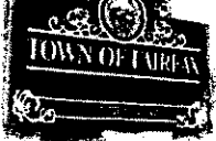
EXHIBIT 3 - FULL PROJECT SCOPE OF SERVICES

project team for alternatives to stabilize existing wingwalls in place and/or repair scour distress, and will prepare brief letters reports to support the preventive maintenance work.