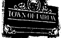
EXHIBIT 3- FULL PROJECT SCOPE OF SERVICES

members will be on hand if needed. Should the removal of any yellow thermoplastic striping be necessary, CIG-MGE will specify its removal storage and disposal per the Caltrans Design Information Bulletin (DIB) 84.