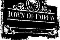
EXHIBIT 3- FULL PROJECT SCOPE OF SERVICES

The key component of the study will be an assessment of the noise and vibration resulting from pile driving or drilled piers and other noise generating activities during construction. Hydroacoustic sound levels will be submitted to Kelly to assess impacts to any protected biological resources potentially affected by noise. The impacts of vibration will be assessed against appropriate criteria for construction vibration established by Caltrans and other agencies. If significant noise or vibration impacts are identified, mitigation will be recommended.