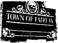
EXHIBIT 3 - FULL PROJECT SCOPE OF SERVICES

submitted to the Town. The project cost estimate will be based on the final checked quantities. A meeting will be scheduled with the Town to discuss the submittal and comments.