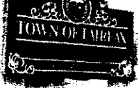
EXHIBIT 3- FULL PROJECT SCOPE OF SERVICES

included the current permit application fees for the various agencies in our budget proposal submitted separately. The environmental staff will attend three public meetings and conduct a workshop at the Charter Meeting.