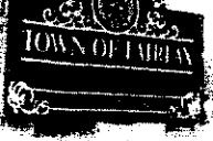
EXHIBIT 3 - FULL PROJECT SCOPE OF SERVICES

Deliverables - A consolidated list of deliverables for each of the 3 project components is presented based on the scope tasks. Numbers in brackets indicate hard copies submitted. Where the number is not shown, the requisite copies will be provided. Unless otherwise noted, deliverables are for all 5 bridges.