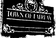
EXHIBIT 3- FULL PROJECT SCOPE OF SERVICES

Topographic mapping will be prepared at a scale of 1" = 20' with one foot contour interval and spot grades meeting National Mapping Accuracy Standards. The estimated limits of the aerial mapping is 200' each side of the bridge along the road and 300' upstream and downstream of each bridge.