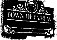
EXHIBIT 1 – MEADOW WAY BRIDGE ASSESSMENT & BPMP PHASE 1 SCOPE OF SERVICES

findings from the assessment reports and options will be discussed at another community workshop. Input received from that community meeting will be compiled in a report and presented to the Town Council along with findings from the assessment report and possible options to be considered.