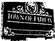
EXHIBIT 3- FULL PROJECT SCOPE OF SERVICES

Bridge Advance Planning Studies (Meadow Way only). An Advance Planning Study (APS) will be prepared for Meadow Way to present the optimum bridge types. Up to three viable bridge types, minimizing disruptions and expediting construction, will be presented and the most suitable bridge recommended. The results of geotechnical investigations and hydraulic and geomorphic studies will be reflected in these studies. Conceptual design construction cost estimates will be prepared for each alternative. The APS package will be used to define the bridge work for the environmental process.