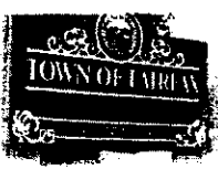
EXHIBIT 3- FULL PROJECT SCOPE OF SERVICES

Caltrans Bridge Inspection Reports (BIRs) and field measurements and observations. Show the bridge plan, elevation and cross section views on each GP. The bridge shapes, railings, sidewalks and piers will be depicted on the GPs. Additional useful information, such as the Caltrans bridge number and year constructed will be added.