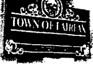
EXHIBIT 1 – MEADOW WAY BRIDGE ASSESSMENT & BPMP PHASE 1 SCOPE OF SERVICES

scour and bank erosion, fire truck weight and other loading issues, and flood and fish passage. Instead of the 30% Design submittal in this task, the Phase 1 engineering deliverable target will be a 15%-20% product. The tasks from 10-2.1 will include: Preliminary APE Map and Field review, Preliminary Roadway Geometrics, Design Exceptions, Structural Aesthetic Features and Bridge Advance Planning Studies. If bridge replacement becomes the preferred alternate by the Town, MacDonald Architects will coordinate with the project's bridge engineers in conceptualizing the design of a new Meadow Way Bridge and all of its related architectural amenities. Design concepts will reflect input from the community workshops. Up to two viable bridge types will be presented and the most suitable bridge recommended. A combined meeting for Bridge Type Selection and Bridge Retrofit Strategy (Creek Road) will be held. If needed, MacDonald Architects can also provide design guidance for any bridge retrofit program.