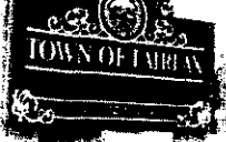
EXHIBIT 3- FULL PROJECT SCOPE OF SERVICES

Construction Air Quality Impacts. Construction air quality impacts will be addressed qualitatively, focusing on identifying appropriate control measures to reduce PM 10 from dust generation. Where necessary, the Roadway Construction model developed by the Sacramento Metropolitan Air Quality Management District will be utilized to predict exhaust emissions.