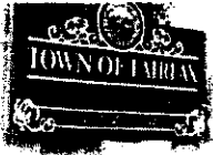
EXHIBIT 3 - FULL PROJECT SCOPE OF SERVICES

Project Description Development - The project descriptions will be developed as early in the process as possible. WRA will review the initial project descriptions and additional relevant materials provided by the team and help refine them to coordinate the workflow for the CEQA/NEPA process, if necessary.