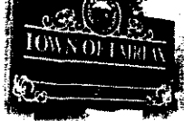
EXHIBIT 1 – MEADOW WAY BRIDGE ASSESSMENT & BPMP PHASE 1 SCOPE OF SERVICES

The tasks in the overall Scope of Services, Exhibit 3, are modified for Phase 1 as follows.