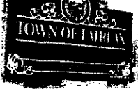
EXHIBIT 3 - FULL PROJECT SCOPE OF SERVICES

project, will be included. Geomorph will assist the project team to develop initial and final designs, obtain permits, and implement key measures of each project.