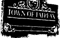
EXHIBIT 3- FULL PROJECT SCOPE OF SERVICES

Drainage Facilities Plans (Meadow Way only). An analysis will be done to determine the drainage needs for the proposed improvements at Meadow Way. Preliminary drainage plans will be developed using a 10-year storm as the design criteria. This analysis will determine catch basin locations and pipe sizing needs.