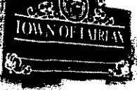
EXHIBIT 3 - FULL PROJECT SCOPE OF SERVICES

materials; and preparation of a Phase I ISA report, including summary of activities, findings, and our opinion regarding the potential for on-site contaminated materials and recommendations regarding further investigation.