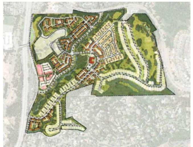
Oak Knoll Master Plan Diagram

Assignment: SunCal submitted an application to develop the former Oak Knoll Naval Medical Center, Oakland as a new master-planned community known as the Oak Knoll Mixed Use Community. The application requested planning-related permits including a General Plan amendment, rezoning and other planning-related actions to develop 918 residential units and 72,000 square feet of primarily neighborhood-serving commercial uses. The project also entailed relocation and rehabilitation of the historic Club Knoll building to accommodate commercial uses and civic uses, with the remainder of the site consisting of parks, open space and streets. Scott Gregory served as contract planner to the City, assisting in project review and General Plan consistency determinations, as well as drafting a new zoning district for the Project. He provided detailed peer-review of the EIR.