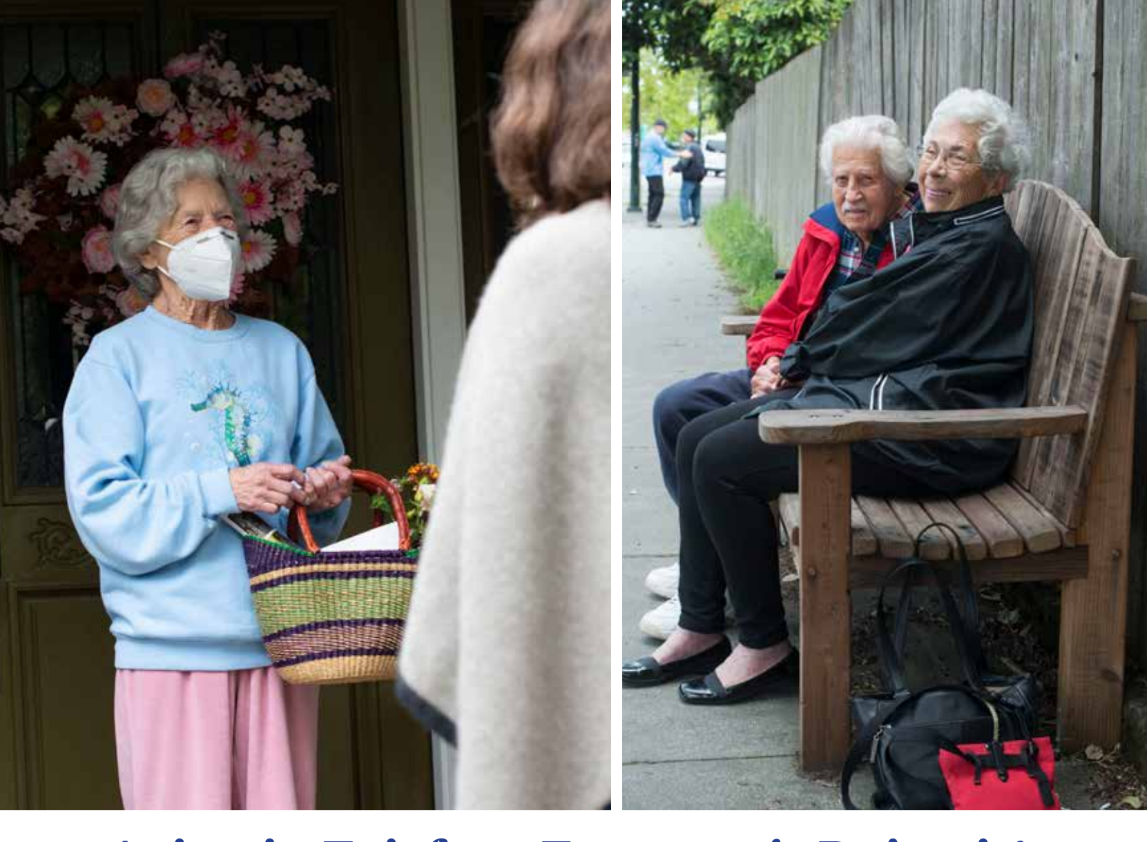
Aging in Fairfax - Everyone's Doing it!