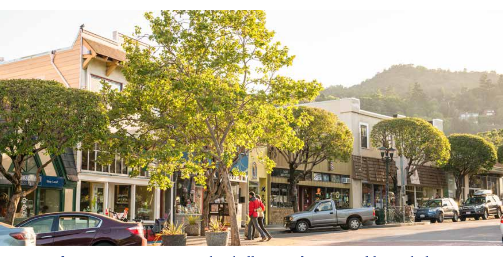
A five-year project to meet the challenges of growing older with dignity and grace in the Marin County Town of Fairfax, California