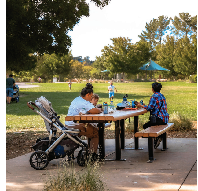
Organizations focused on supporting individuals or groups that were underrepresented in our survey