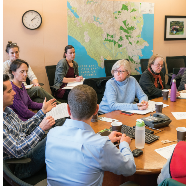
Environmental, recreation, and community organizations that have previously expressed interest