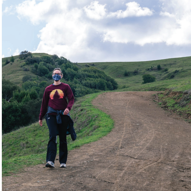
Individuals who signed up via website