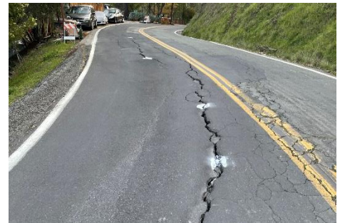
The 9 slides from 2022-23 storms do not include known vulnerabilities at other road sections.