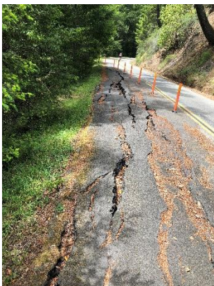
Road damage from 2021 storm, still in need of permanent repair.