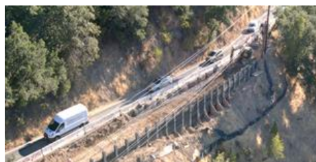
Slides have caused the road to close to one-lane in several locations, limiting emergency access.