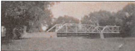
Old bridge.

The South Branch Reservation totals over 1000 acres. Besides providing recreational opportunities, the reservation helps preserve the South Branch of the Raritan River Watershed and provides wildlife habitat.