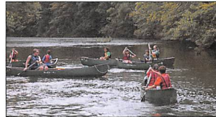
Canoe trip on the South Branch River

The area just beyond the parking lot could be used as river access for canoes. Canoeing the South Branch of the Raritan River is a wonderful way to view wildlife. The river corridor provides an excellent habitat for waterfowl, which can be viewed all along the river. Aquatic reptiles, such as Painted Turtles, are regularly observed perched on the stone and tree outcroppings along the banks of the river.