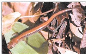
Red-backed Salamander—red phase

Today, the South Branch Reservation totals over 1000 acres. Besides providing recreational opportunities, the reservation helps preserve the South Branch of the Raritan River Watershed from development and provides wildlife habitat.