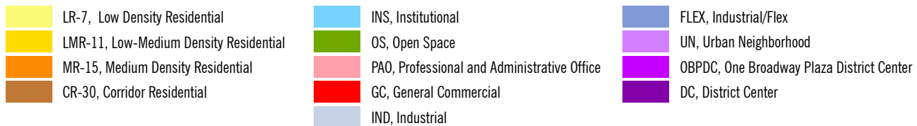
FIGURE LU-4 DENSITY AND INTENSITY MAP